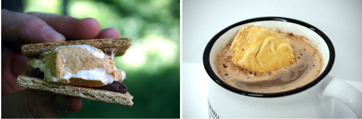
Maple marshmallows make decadent upgrades to s'mores and hot cocoa.