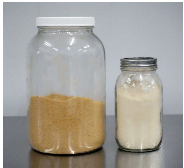
Granulated maple sugar before (left) and after (right) grinding to a powder using a melanger.

Large-scale production of powdered sugar can be hazardous due to the combustible nature of sugar dust. These instructions are only intended for production of small batches of powdered sugar. Promptly clean any surfaces that may become coated with sugar dust.