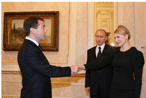
Russian-Ukrainian relations have been strained as a result of Ukraine's Western ambitions

In 2010 Russia will continue negotiations to join the WTO that have unsuccessfully dragged on for over 15 years. The initiative proclaimed by Vladimir Putin on