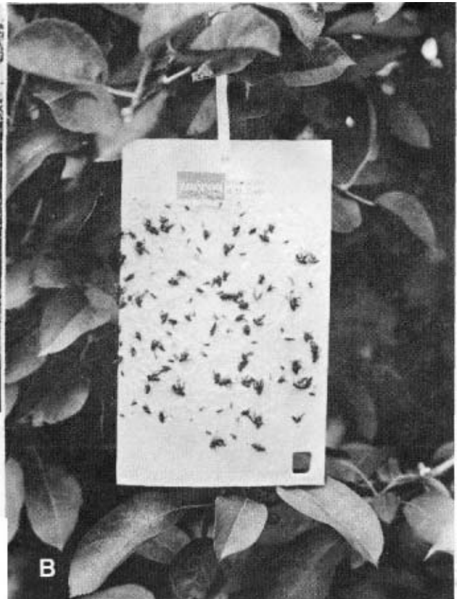
Figure 2.—(a) Proper placement of a sticky board in an apple tree. (b) Close-up of the sticky board.