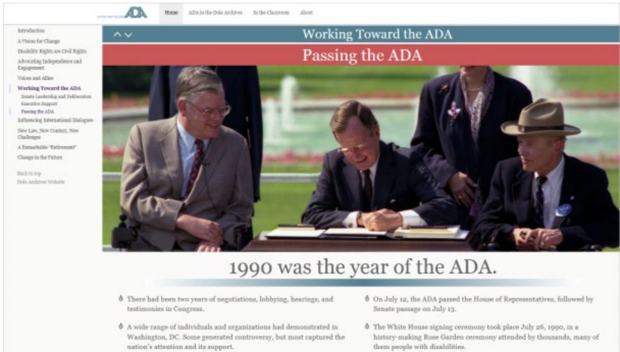
Sample exhibit section displayed in a desktop layout