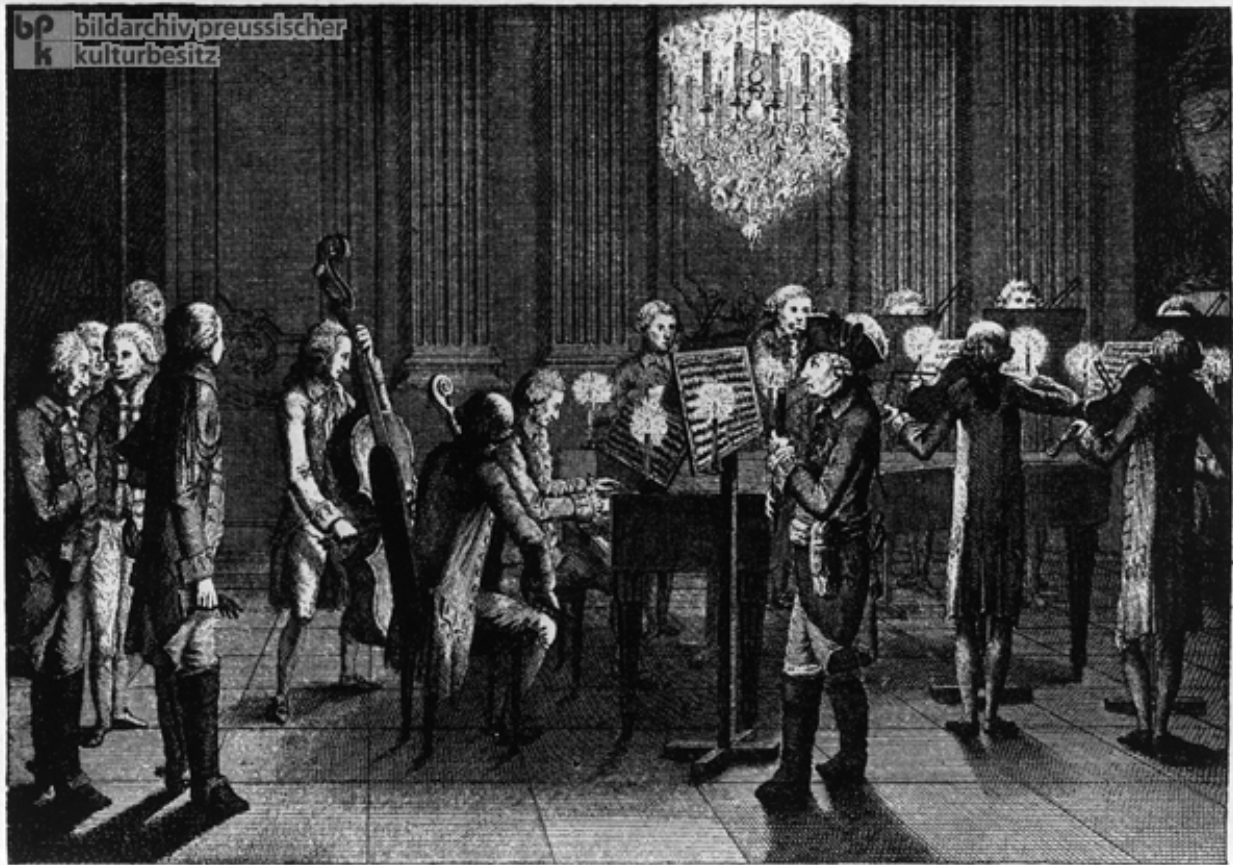
Figure 3.3: Johann Peter Haas's copperplate engraving of Friedrich II als Flötist bei einem abendlichen Konzert im Jahre 1750

However, this is not the only way to interpret this painting. An alternative reading positions the chandelier's glow as a metaphor for the Enlightenment, and the central figure as emblematic, not of melody and song, but rather of enlightened absolutism. In this sense too, Haas's painting foregrounds meanings of musical taste in the culture of sensibility; as suggested, the double-edged nature of taste in this period accommodates two sets of temporal readings. Writers and musicians likewise incorporated an historicized notion of taste into their writings; in the process, as Haas's painting illustrates, the individual bodies and unique moments that defined taste in the culture of sensibility were unselfconsciously abstracted into broader claims about the German "cultural nation."