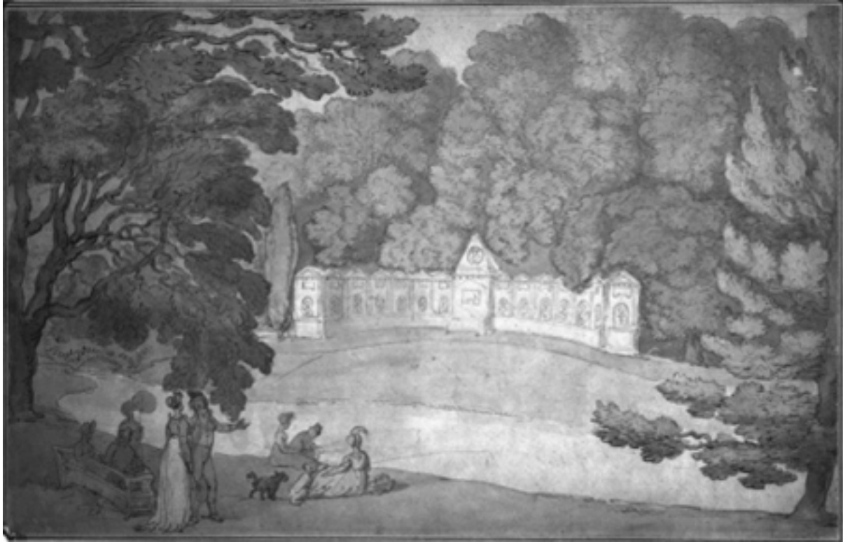
Fig. 3.1: “Temple of British Worthies at Stow,” Thomas Rowlandson, late 18 th century, pen and watercolor on board. Huntington Library, Art Collections

William Mason’s Heroic Epistle to Sir William Chambers speaks directly to this (proto-) nationalist agenda: