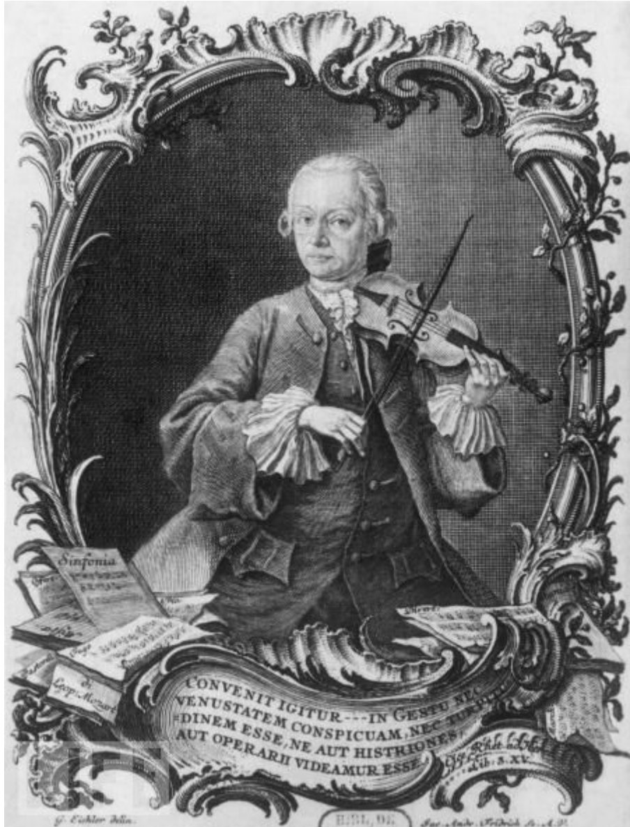
Figure 2.1. Leopold Mozart (1719-1787), engraving by Jakob Andreas Friedrich, after Matthias Gottfried Eichler, 1756. Frontispiece to Leopold's Violinschule .

It may come as no surprise, then, that the frontispiece of Leopold's Versuch comprises an engraved portrait of its author that melds the image of the artist to that of the man of cultivated taste (fig. 2.1).