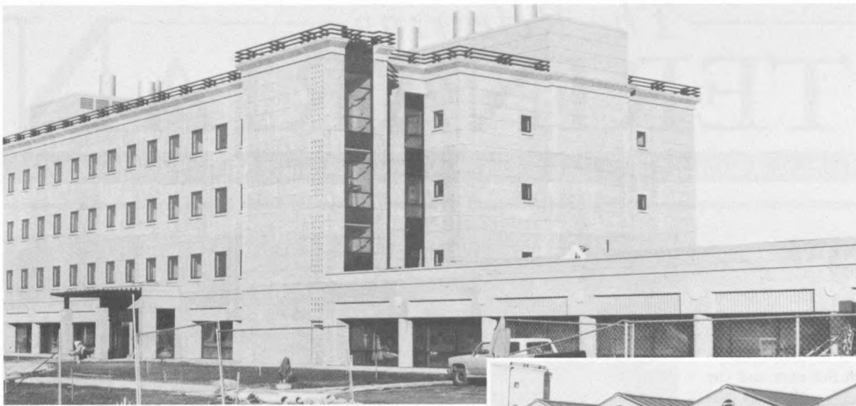
Above: A recent view of the Veterinary Medical Center taken from the southeast looking northwest. The small animal clinic is in the foreground. At right are the large animal clinic and barns, which are appended to the east end of the new VMC.