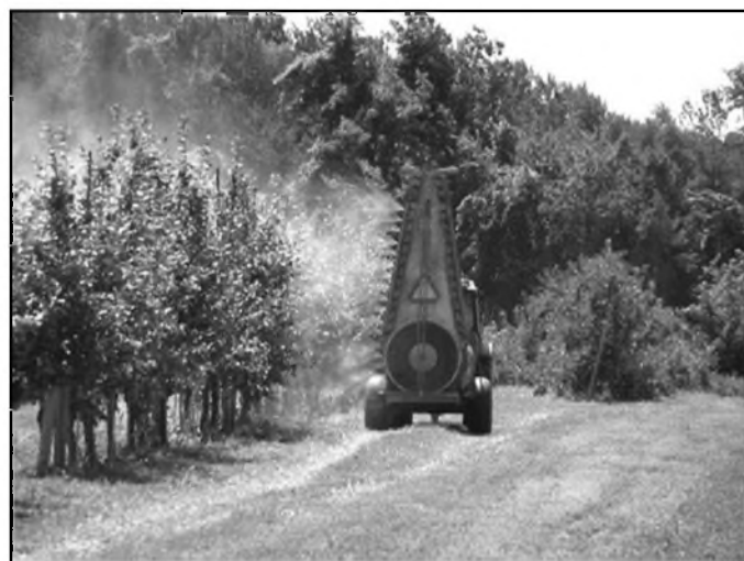
Durand Wayland representative demonstrates the accuracy of the sensors on the tower during a SmartSpray demonstration at Kast Farms in Albion, NY.

A SWCD representative will meet monthly with farmers to document progress and share data. Results of chemical reduction will be discussed at the annual growers' conference in Syracuse, NY, as well as various grower workshops and presentations. The Lake Plains