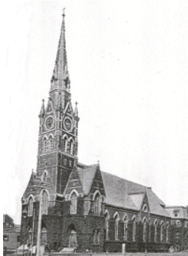
Figure 1.7: Saint Augustine, built 1868, 845 East Broadway; Architect: Patrick Kelly