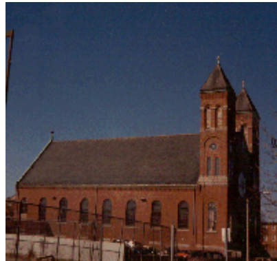
Figure 1.9: Saint Peter, built 1899, 75 Flaherty Way; Architect: Patrick Ford