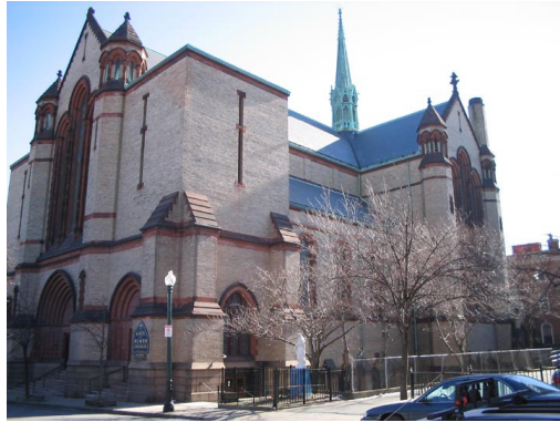
Figure 1.6: Gate of Heaven, built 1896, 615 East Fourth St; Architect: Patrick Ford