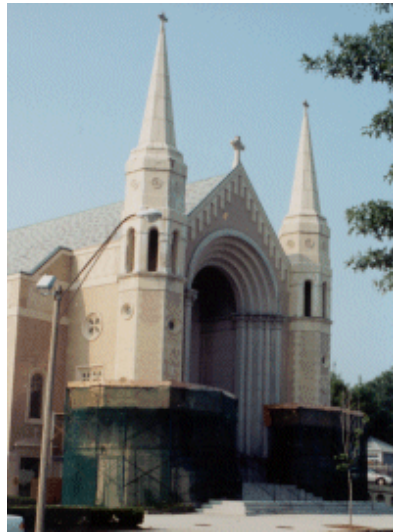
Figure 1.2: Saint Brendan, built 1937, 589 Galvin Blvd; Architect: Raymond J. Gorani