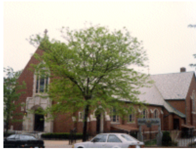
Figure 1.8: Saint Brigid, built 1930, 845 East Broadway; Architect: Maurice Meade