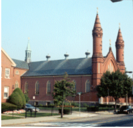
Figure 1.5: Saint Gregory, c. 1852, 2215 Dorchester Ave; Architect: Patrick Ford