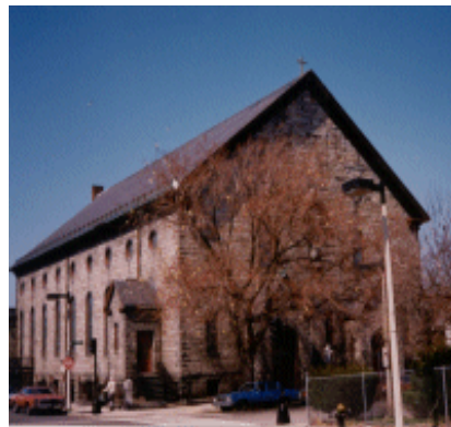
Figure 1.10: Saint Vincent de Paul, built 1872, 1524 VFW Parkway; Architect: Patrick Keely