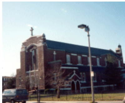
Figure 1.3: Saint Mark, built 1914, 175 Dorchester Ave; Architect: Charles Brigham