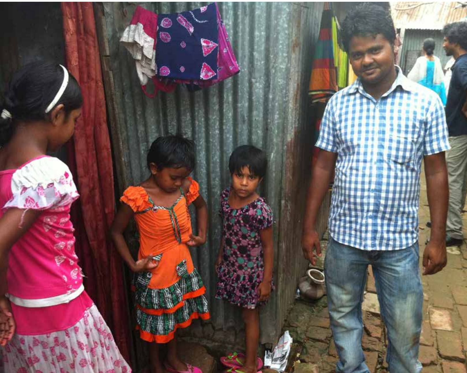
Garment workers live in concentrated housing communities. Many families live in one-room structures beside dozens of other families with whom they share common kitchen, water, and bathing areas.

“WE HAVEN’T BEEN ABLE TO PAY OUR RENT... ALREADY SOME PEOPLE HAVE LOST THEIR ROOM.”