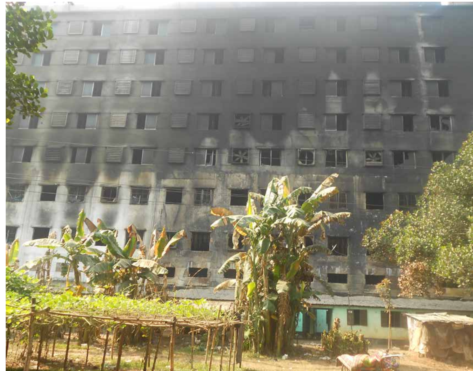
Tazreen Fashions factory, after the fire.

All the US corporations including Walmart, Sears/Kmart, Enyce (Sean John Apparel), Delta Apparel, Dickies and Disney along with French brand Teddy Smith, have refused to pay any compensation to the victims, have failed to attend the meetings on Tazreen compensation and have not been willing to engage with trade unions directly to arrive at full and fair compensation for Tazreen victims.