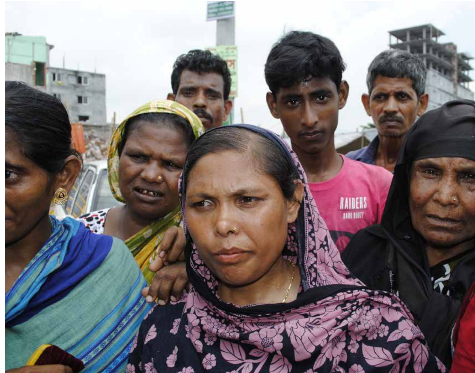
Affected family members.