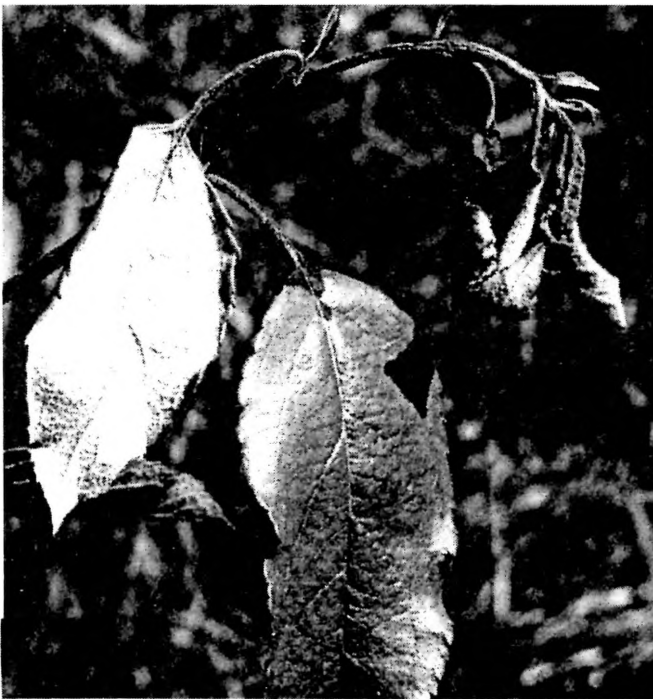
Fig. 1. Early symptoms of fire blight on a terminal shoot. Note the blackened mid-vein at the base of the leaf blade.

A: No good answers here. Anything that helps to shut down tree growth will help to limit the spread of blight since the epidemic stops when terminal buds are set. Lucky growers never get blight, but if they do, they only get it in drought years when trees stop growing in mid-June. (This is not a lucky year!) Obviously, blocks with blight should not be trickle-irrigated until well after terminal bud set. Allowing weed regrowth beneath trees may increase competition for water and nutrients, thereby helping to slow tree growth.