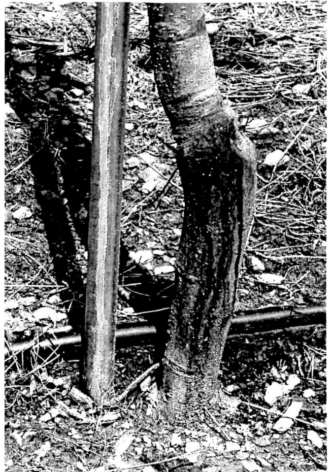
Fig. 2. Bacterial ooze on the rootstock portion of a Gala/M.9 tree indicates that fire blight has reached the rootstock.

fall, and some will survive until next spring when they will wilt and die soon after bud break. Incidence of root stock blight can range from less than 5% of trees to more than 80% in a severely blight block. Rootstock blight is most common in orchards less than 6 years old, but other factors that make trees susceptible to rootstock blight have not been determined. ❖❖