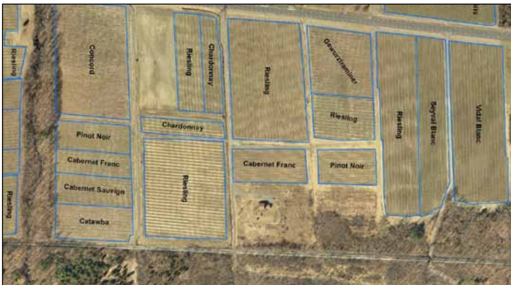
An example of a map generated by GIS software. With this software we can quickly pull up any vineyard block that matches the set of criteria we are looking for.

Today, roughly 8,400 acres of vineyards have been mapped and there are still more to go. Keeping the maps up to date is not an easy task, so we need your help. If you have planted a new vineyard, taken out an old one, or just think we haven't mapped your vineyard yet please let us know. A great opportunity to do so would be at the Finger Lakes Grape Growers Conference and Trade Show in Waterloo. We will have printed maps of all of the vineyards in the Finger Lakes, so please stop by and help us keep on top of this ever-changing project. The more vineyards we have mapped, the more accurate we can be with the information we disseminate to growers and other researchers.