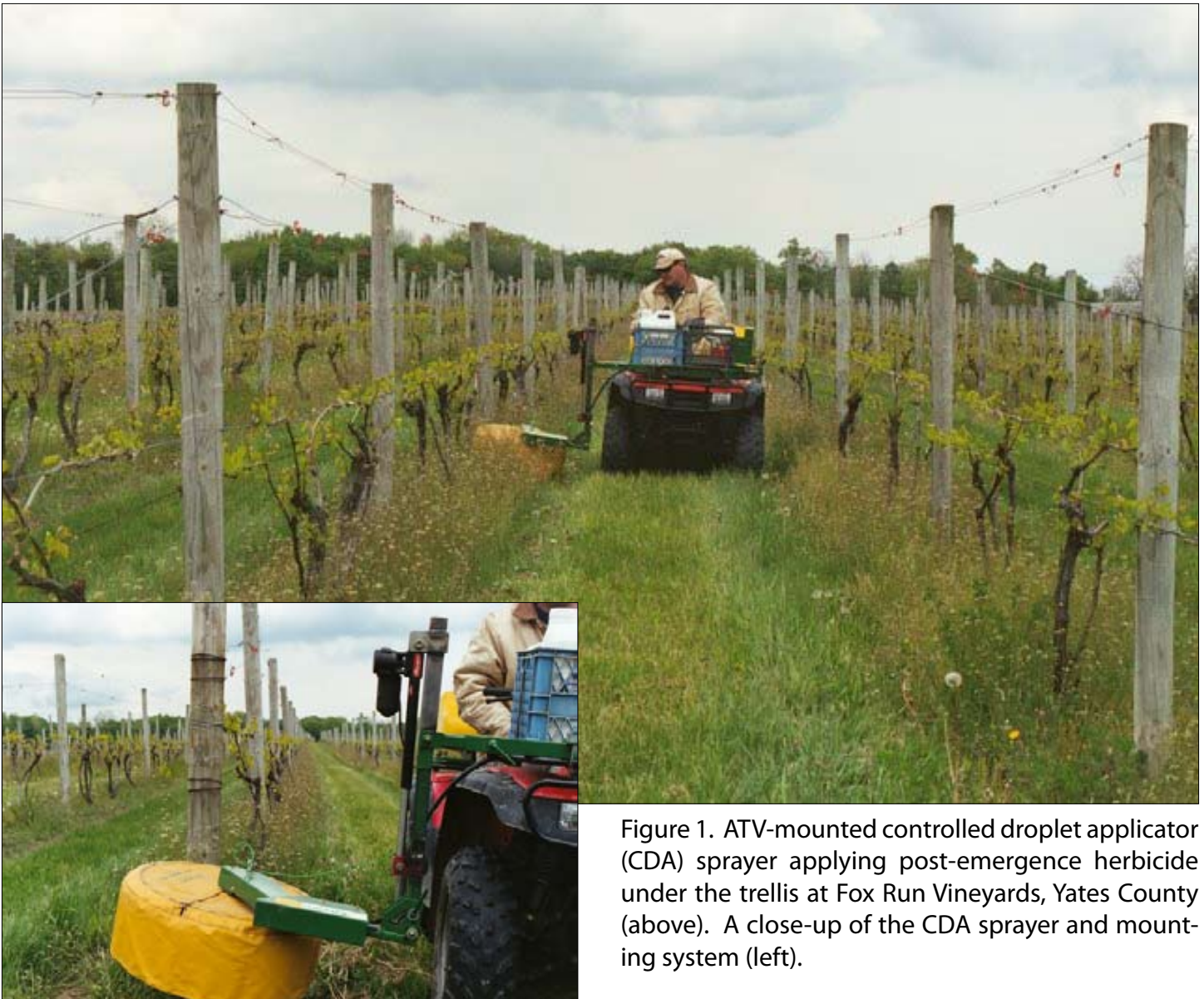
Figure 1. ATV-mounted controlled droplet applicator (CDA) sprayer applying post-emergence herbicide under the trellis at Fox Run Vineyards, Yates County (above). A close-up of the CDA sprayer and mounting system (left).

cal sensors that turn nozzles on and off. The infrared sensor senses chlorophyll in the plant, thus they function in either light or dark. Spraying in the evening is sometimes preferable as the wind often dies down. These applicators are designed for post-emergence applications and are best used before weed growth is out of control. In the annual NY & PA Pest Management Guidelines for Grapes , Landers further explores height of the boom from the ground and correct selection of nozzles as a means of further reducing drift. Generally, drift increases with increased boom height from the ground and with smaller droplets.