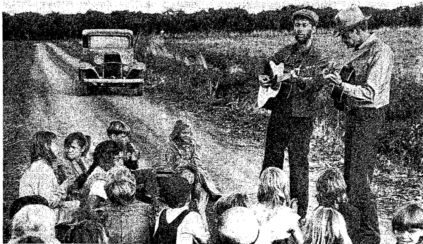
David Carradine as Woody Guthrie and Ozark (Ronnie Cox) in "Bound For Glory"