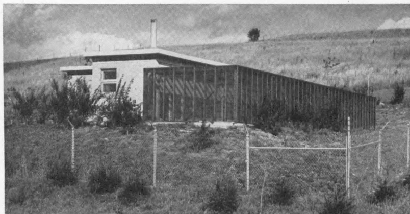
The Gaines Isolation Kennel, showing security fence to keep out stray animals and the runways screened to keep out insects.

Daynemouth Division* Studies are continuing on distemper virus and the mechanism responsible for its production of nervous manifestations. Isolation of a particular strain of distemper virus from a dog with encephalitis, designated as "Snyder Hill", has provided an important means for analysis of factors involved in the production of encephalitis.