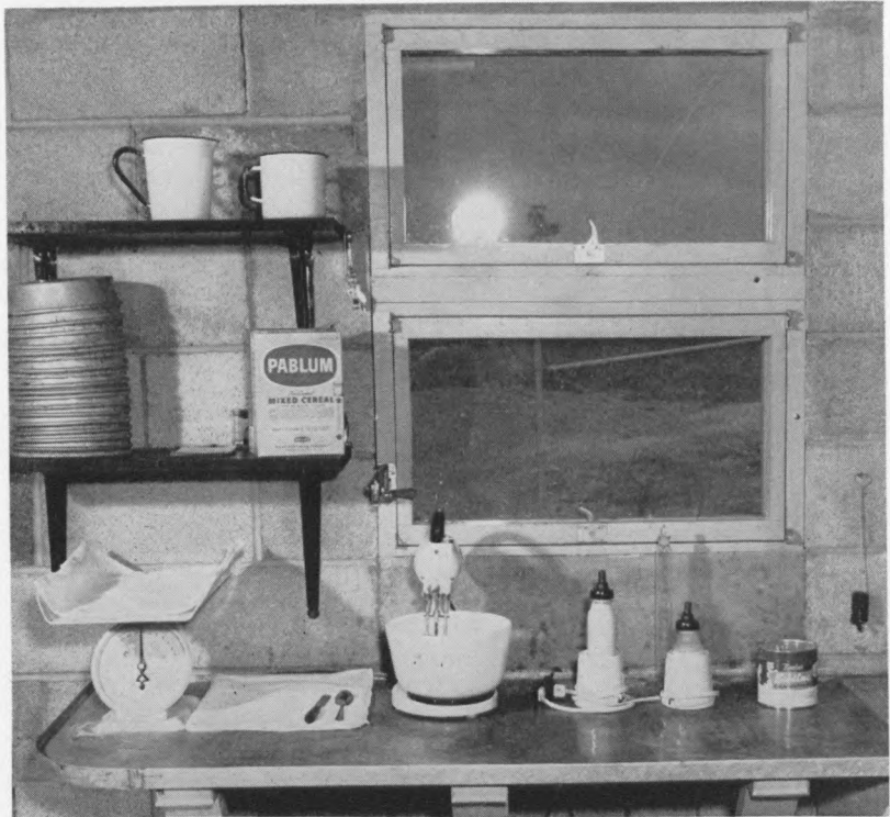
Puppy formula shelf. The younger puppies must be fed every four hours, day and night.

In an investigation of diseases in cattle, an agent of the elementary-body type has been found and named Miyagawanella bovis in keeping with the classification in Bergey's Manual. Progress has been made in characterizing the morphological, serological, epidemiological and pathogenic features of this agent. It appears to be an important cause of dis-