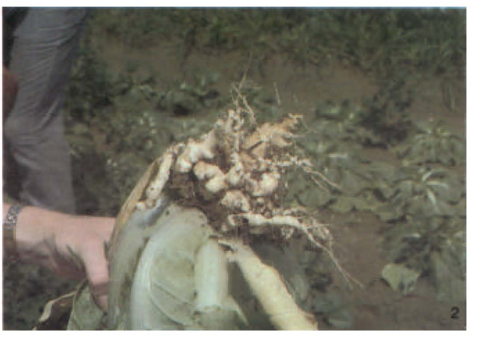
We acknowledge photo 2 provided by R. Loria.

Most susceptible: cabbage, Chinese cabbage, brussels sprouts, some turnips, wormseed mustard, and some species of candytuft Medium susceptible: kohlrabi, kale, cauliflower, collards,