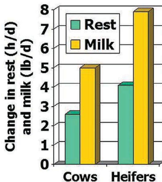
Figure 1. When time outside the pen is kept to 3, rather than 6 hours/day, cows respond with more time lying and higher milk production.

associated with improvement, or neglect, of cow comfort are very real. Research makes it clear that there is a predictable link between management, cow behavioral responses, and productivity and health. Now is the time to take advantage of what we know about improving cow comfort to improve the farm's bottom line. □