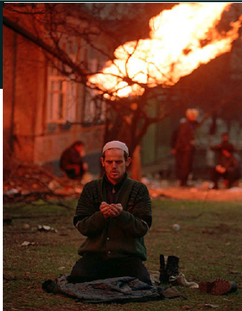
A MAN PRAYS DURING THE BATTLE FOR GROZNY IN THE FIRST CHECHEN WAR. THIS IMAGE OF PEACEFUL ISLAM AGAINST THE VIOLENCE RAGING BEHIND SHOWS THE BIASES IN PERCEIVING MUSLIMS

been an incessant uneasiness among Russians that the neighboring Turks will spread their influence and consolidate Islamic forces in the region. A number of developments, “such as the establishment of the Assembly of Turkic Peoples in 1991...help solidify these fears and are manipulated by ultra-nationalists.” 11 The influence of these two notions highlights the complicated relationship Russia has had with the Muslims’ circumference around the Russian Federation, thus leaving the religion as the hostile “other” ill-fated to reconcile with Russian nationalism.