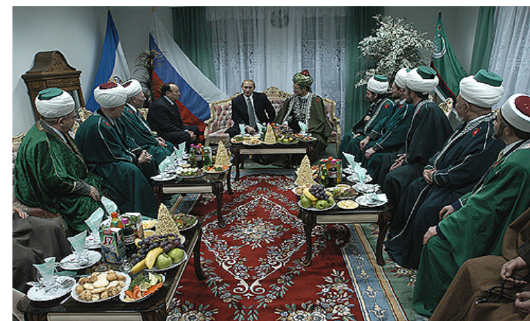
PUTIN IN A MEETING WITH SUPREME MUFTI SHEIKH-UL-ISLAM TALGAT TAJUD-DIN, CHAIRMAN OF THE CENTRAL MUSLIM BOARD OF RUSSIA AND OTHER RELIGIOUS LEADERS

The economic woes within the Caucasus and Central Asia, in addition to the rise of Moscow as a hub of economic opportunity, caused a demographic shift within the city subsequent to Soviet rule. Following the fall of the Soviet Union, the newly formed territories experienced economic and social chaos. The dawn of the twenty-first century seemed to bring economic recovery for many of these states; however, while many of the Central Asian states have experienced economic growth, these increases can be accredited to oil and other natural resources. 19 Thus, this