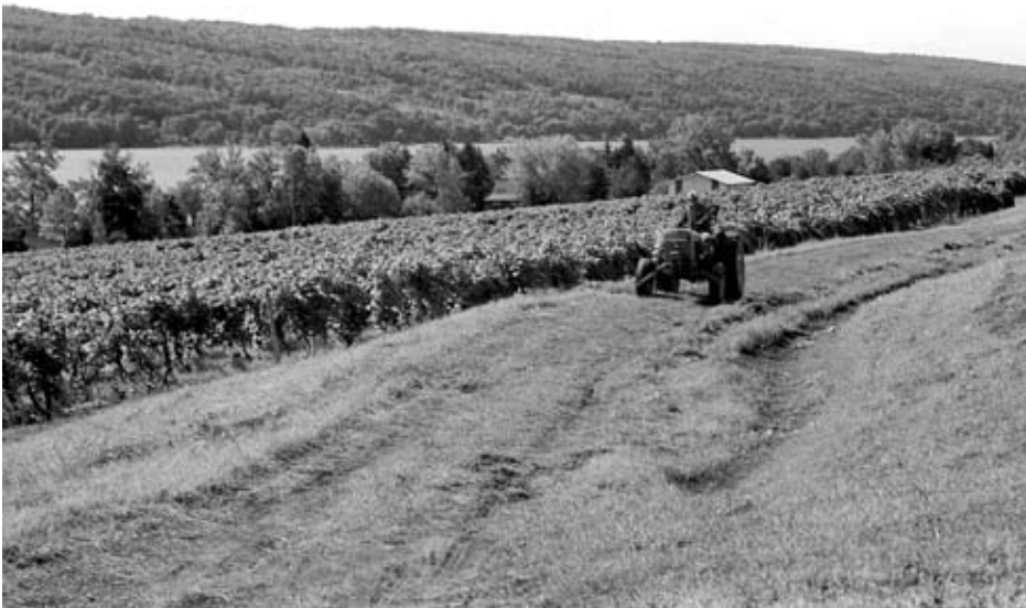
Diversion ditches channel excess water around vineyards, reducing potential runoff and erosion.