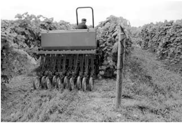
This No-till seeder plants cover crops without the need for additional soil protection, maintaining protective stubble on the surface while the cover crop germinates.

Using cover crops and mulches to protect the soil surface has an enormous effect on annual rates of erosion. Mulches reduce the force of rainfall hitting the soil by 98%, according to Jim Balyczek, Yates County Soil Conservation District Manager. Use of permanent cover crops in row middles on a 10% slope with 200 ft slope length reduced potential annual erosion from 5.1 T/acre under ‘clean tillage’ to 0.39 T/acre, in an example provided by Tibor Horvath, NYS Conservation Agronomist, USDA Natural Resources Conservation Service.