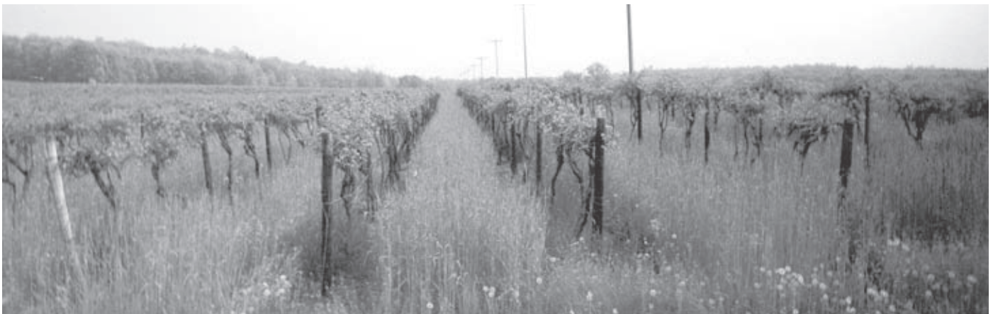
Cereal rye seeded in row middles protects soil from the force of raindrops hitting bare soil.

Soil conservation practices prevent erosion and maintain clean water in three ways. First, diversion of water around vineyards keeps water clean, because it doesn’t wash over disturbed soil in the first place. Filtering of water through soil (drainage systems) and ground cov-