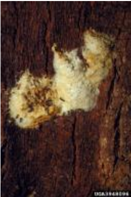
Egg mass and hatching larvae.

Male moths are brownish with black markings and have a wingspan of 1 to 1 1/4 inches. Females have white wings with dark markings and a tan to buff colored body. Females are heavy bodied and do not fly.