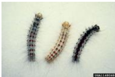
Larvae (caterpillars).

Small larvae are dark brown to black and very hairy. As they reach maturity they become slate colored and have 2 rows of blue spots (5 pairs) followed by 6 pairs of red spots on the back. Fully-grown larvae are 2 to 2 1/4 inches (50-56 mm) in length.