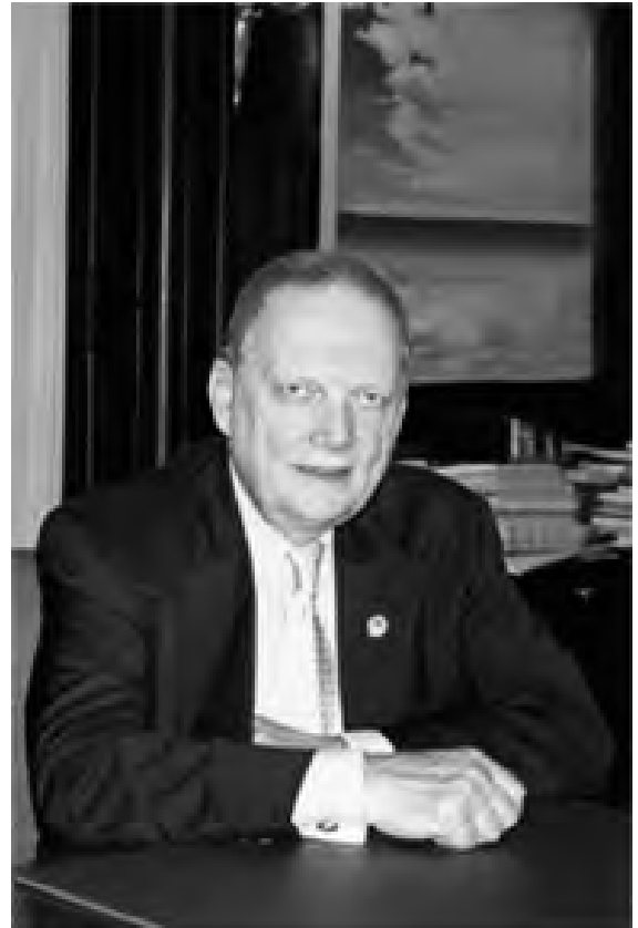
Ambassador Luigi R. Einaudi

What countries matter for United States foreign policy? They all matter. The problem with the Bush administration is that it did not listen. Other countries felt