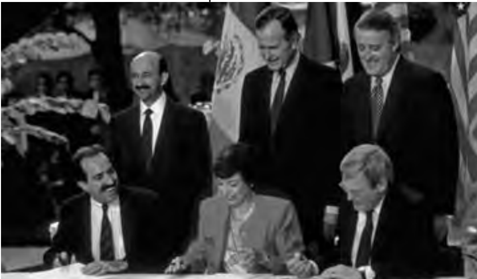
Signing of the NAFTA Treaty, December 17, 1992 by U.S. President Bush, Canadian Prime Minister Mulroney, and Mexican President Salinas.

The Organization of American States, OAS is not the Monroe doctrine. The survival of a functioning western hemisphere relationship is of as much interest for Latin America as for the United States. The problem with the OAS is that the United States lacks the interest to work seriously on regional problems such as drugs and the environment that require a multilateral framework to be dealt with successfully. Regionalism can be very helpful but it must be founded on the basis of universal principles, participation and support.