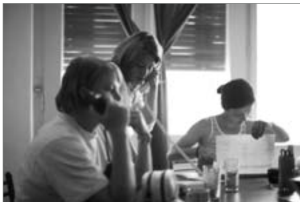
Activists at work, Shtip, Republic of Macedonia

At a national level, it is also very important to develop initiatives for the determination of a legal minimum wage and for the formulation of equal pay for equal work legislation.