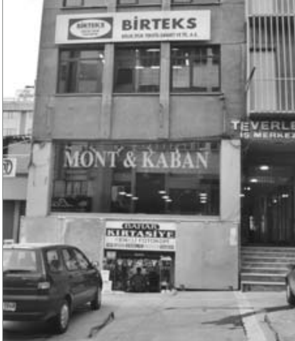
A whole district of Istanbul devoted to garment production