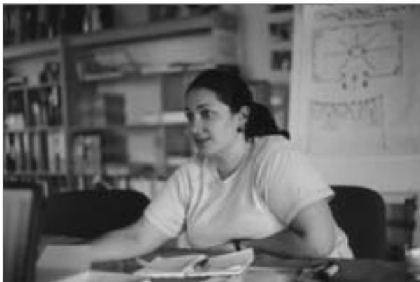
At the office of Women's Alliance for Development, Sofia

The worker interviewed knew of no unions in the factory nor of any attempts to form one. There was simply "no such thing". Every worker has to bargain herself with the employer. Still, she believed that they would stand a better chance of getting "just remuneration" for their work if there was some kind of collective representation of the workers with which to approach the owner. The workers had once requested an air-conditioner to lower the high temperatures in the work space. The owner notified them that this was impossible because he had no money.