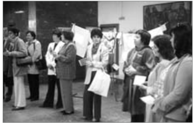
Opening of the exhibition "Fair Conditions for women dressing Europe", Sofia Sep 05

In the meantime a race to the bottom is going on which is, as elsewhere in the world, at the expense of workers, in this case Eastern European and Turkish workers. It deprives them of decent working conditions and leads to the establishment of a new social strata: the working poor. The