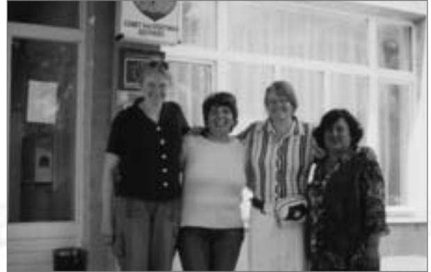
German and Macedonian activists

A safe and hygienic working environment shall be provided, and best occupational health and safety practice shall be promoted, bearing in mind the prevailing knowledge of the industry and of any specific hazards. Appropriate attention shall be paid to occupational hazards specific to this branch of the industry and to ensuring that a safe and hygienic work environment is provided for. Effective regulations shall be implemented to prevent accidents and minimize health risks as much as possible (based on ILO Convention 155). "Physical abuse, threats of physical abuse, unusual punishments or discipline, sexual and other harassment, and intimidation by the employer are strictly prohibited" (Conventions 174 and 176 on industrial accidents, health and safety).