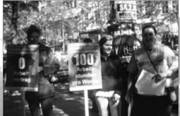
An action at Vienna's center shopping street

"Working relationships shall be legally binding and all obligations to employees under labour or social security laws and regulations shall be respected."