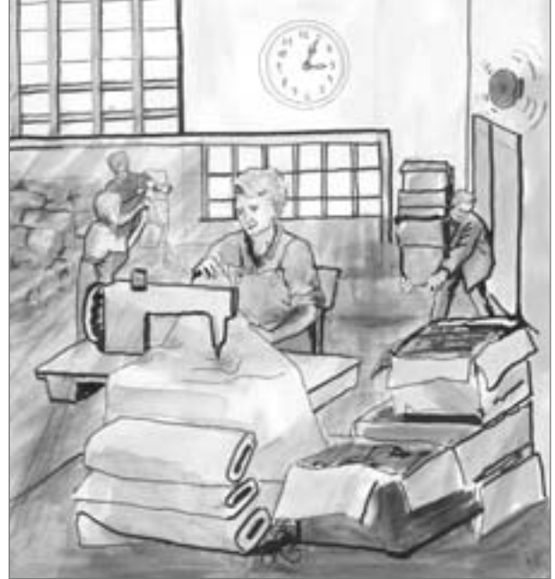
Drawing from the exhibition "Fair Conditions for women dressing Europe", Serbia Sep 05

Use of the toilets is limited: if the supervisor considers that it is being used too often, workers get a warning. The same applies if workers leave their workplaces too often to get a drink of water.