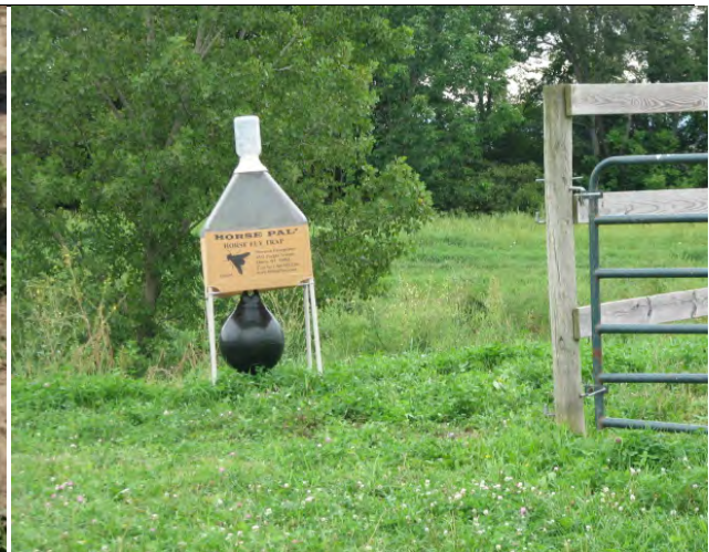
Alsynite Biting Fly Trap for stable fly management