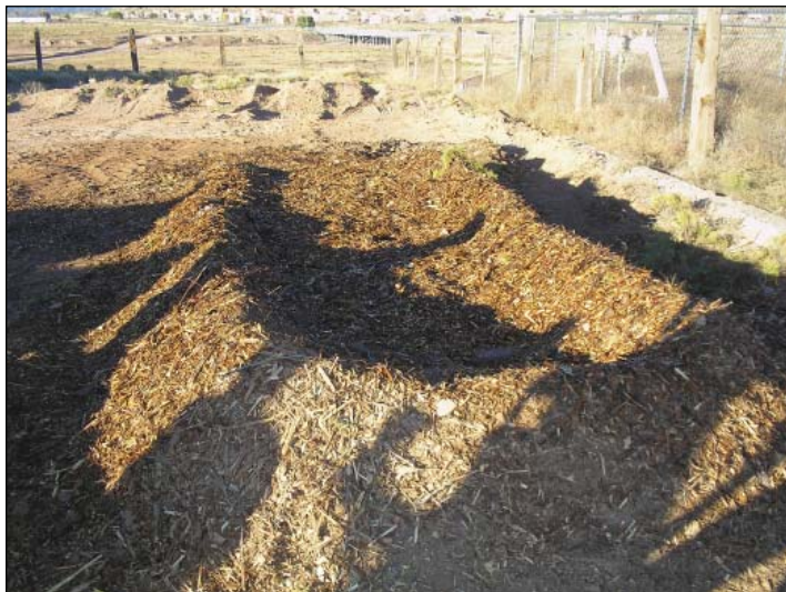
Trench of wood chips for composting butcher waste in New Mexico.

Blood is a little different. If it is still in a liquid form it is not hard to pour. If it has coagulated it is harder because it comes out in gelatinous chunks and clear liquid. Oils and grease will also solidify at cooler temperatures. The