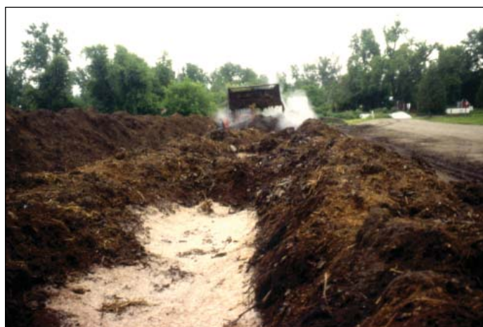
Dairy waste at Intervale compost site.

Site maintenance includes repairing the 1/8 acre mixing/liquid acceptance pad and cleaning the leachate collection tank. The tank is pumped periodically when it reaches capacity and the leachate is put back into trenches in the windrows. They have very few liquid breakouts. The liquid in the leachate tank is mostly rainwater running off the hard surface. If the tank were filled with strong leachate, it would indicate that their process was not working well and management changes would be made. Intervale owns an old pump truck, which they use to empty the leachate collection tank. Every few years the pump is reversed to mix the solids that have settled in the tank. The solids, then in suspension, are pumped out.