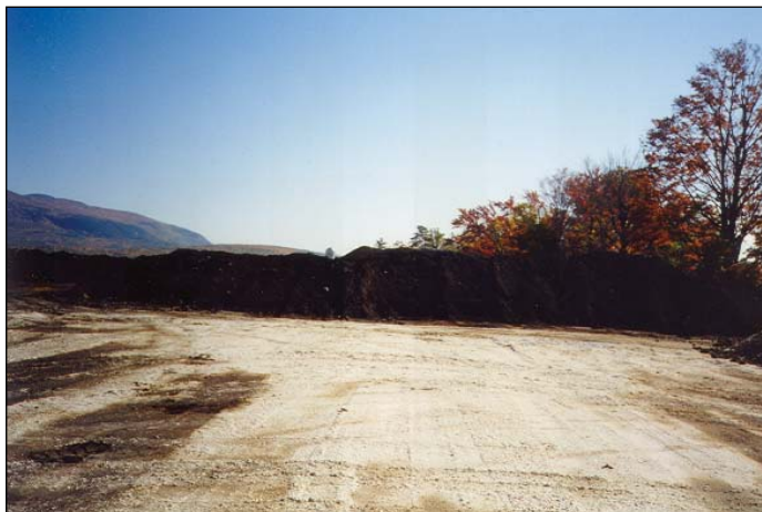
Intervale compost pad in Burlington, VT.

problem with semi-solid liquids is they can slide out of the pile because they do not pour in a continuous stream. Be careful when incorporating semi-solid liquids, dams and well built trenches are especially important. It is also important to consider whether to turn these piles. They may have significant odors and it may be prudent to wait a few weeks before turning. If not turning the windrows, cover the trenches with carbonaceous materials to provide a bio-filter and make sure the mixture is porous enough to allow for good airflow. If a pile begins to smell strongly, cover it with more carbonaceous material, it will act as a bio-filter. The composting process will continue even under anaerobic conditions. Since turning will release odors, do not turn if odors are a concern.