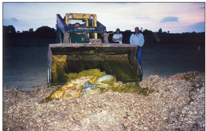
Butcher waste composting in Randolph, NY.

Manure with high water content is generally separated before composting, with the liquid portion being spread on fields. Using the method described in this fact sheet, separation is not necessary. There may be cases where disease and pathogen concerns favor not spreading the liquid component and thus not separating the manure. Blood from