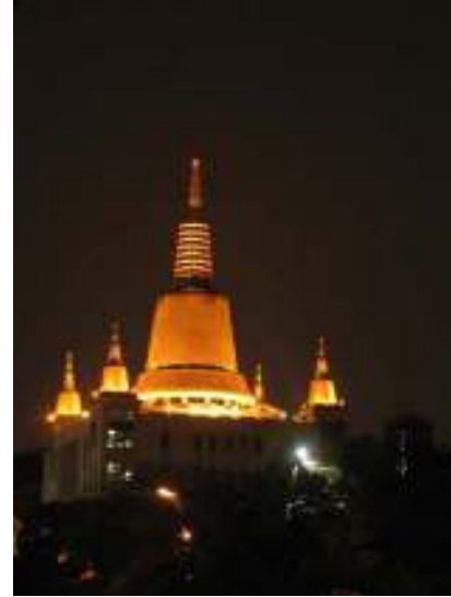
Temples, Churches and Mosques along side each other