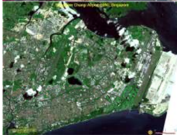
CBD skyline Oil Refineries Changi Airport / Keppel Harbour