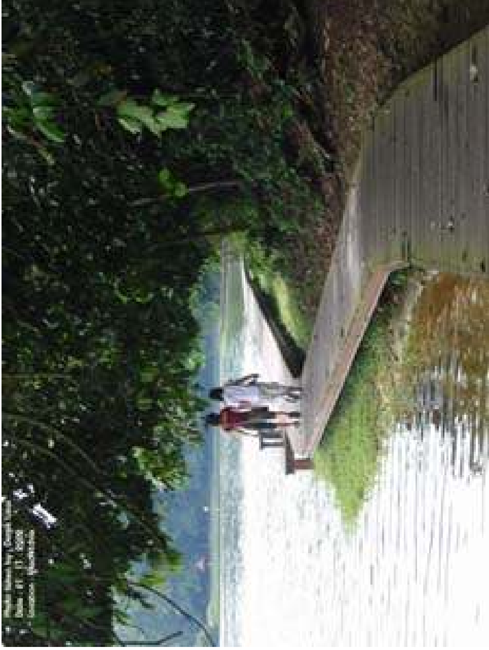
Singapore: Harmony in Diversity