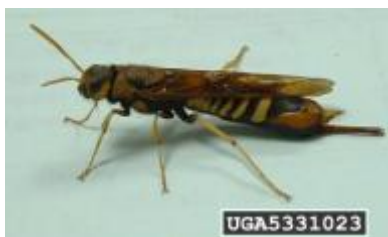
Pigeon tremex.

The horntails are a large family of wasp-like insects whose larvae are woodborers in either hardwoods or coniferous trees. The name horntail is given to these insects because of the horny spear-like plate on the last segments of the abdomen. This horny spear is its egg laying apparatus (ovipositor). Neither sex stings or bites people. Horntails are also called wood wasps or Siricidae . Our most common species in New York State is the Pigeon tremex, Tremex columba .