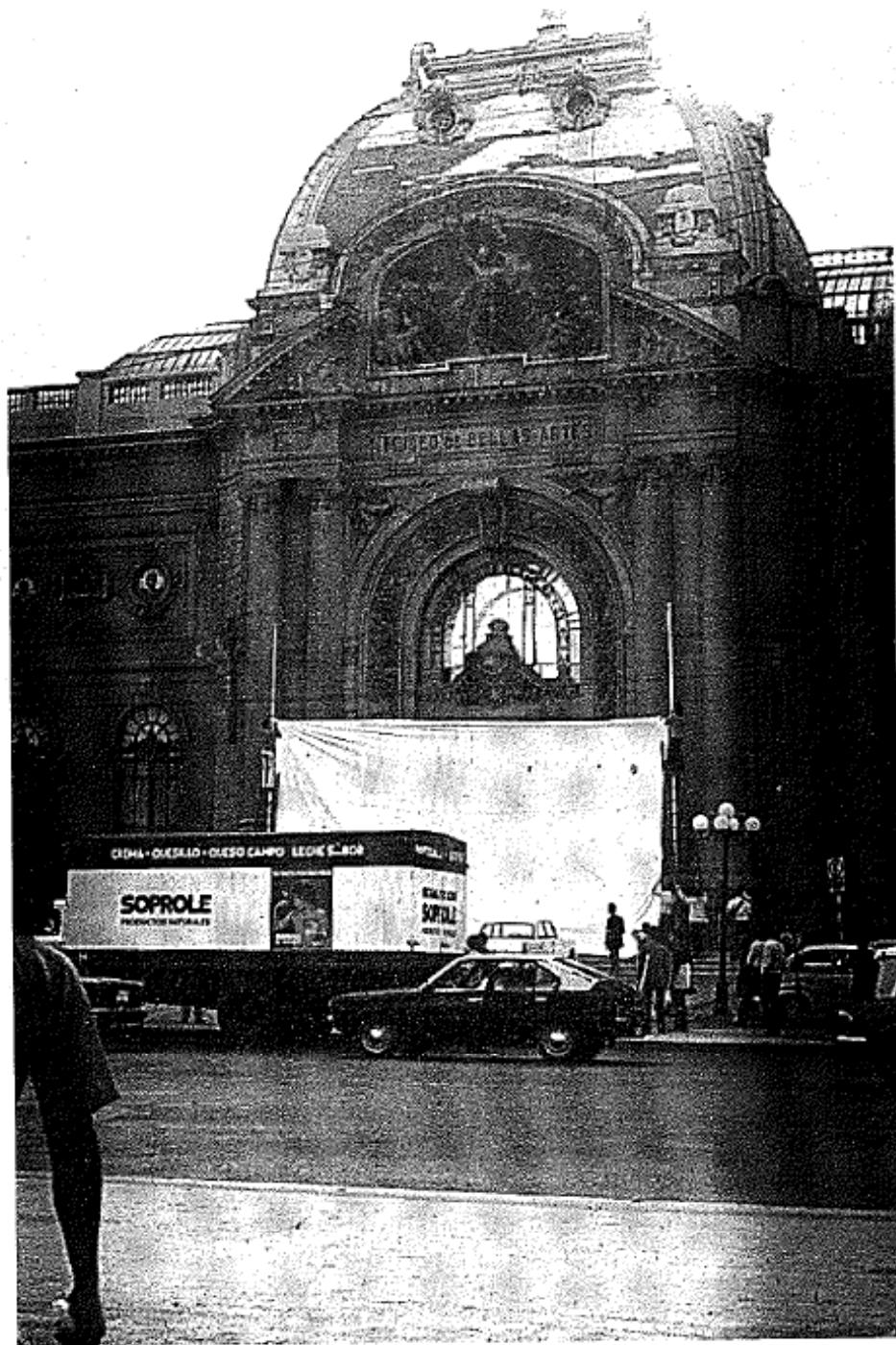
"Inversión de Escena", 1979.