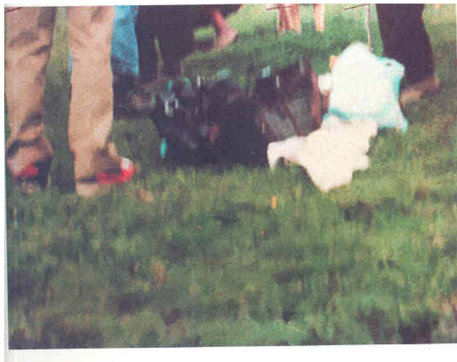
Figure 5 (Staples on the upper edge)