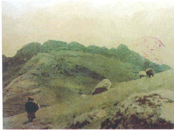
Figure 4 (Red stamp toward the upper right corner)