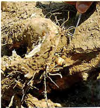
Fig. 9. Broad necked root borer in crown of apple tree

All of these borers are among the most difficult to control of the insects that attack fruit trees because they are concealed