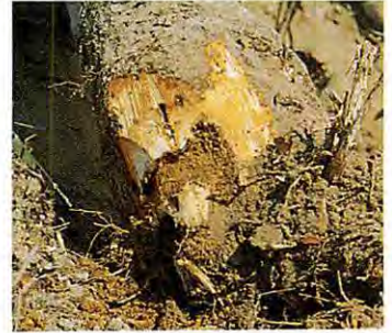
Fig. 13. Gallery of Prionus borer showing darkened frass