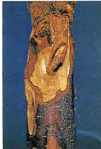
Fig. 10. Pupa of roundheaded appletree borer in its pupal chamber