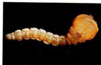
Fig. 7. Flatheaded appletree borer larva (3x actual size)