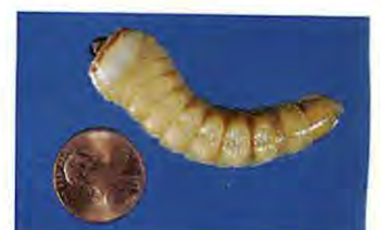
Fig. 8. Broad necked root borer larva (one-third actual size)