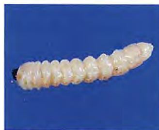
Fig. 4. Roundheaded appletree borer larva (4x actual size)