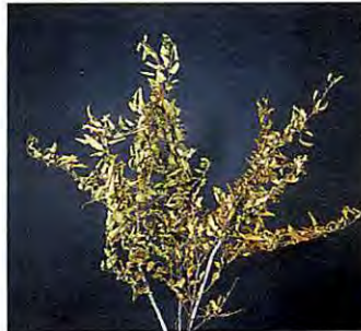
Fig. 11. Tree damage caused by roundheaded appletree borers