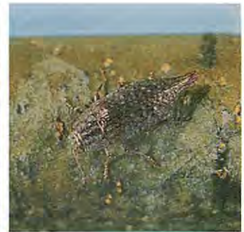
Fig. 2. Adult flatheaded appletree borer (2x actual size)

male lives approximately 40 days, normally hiding by day and secretively laying eggs, usually in young healthy trees. The female makes a longitudinal cut with her mandibles in the bark near the base of the tree, inserting a single egg between the bark and xylem and cementing it in place with a gummy secretion.