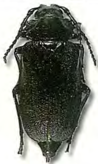
Fig. 3. Adult broad necked root borer (actual size)