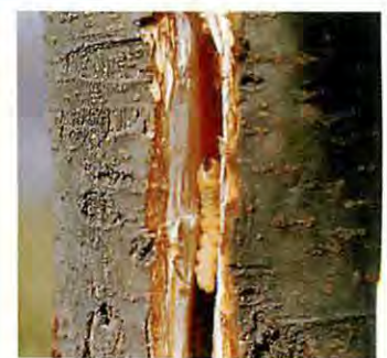
Fig. 6. Roundheaded appletree borer burrow in tree