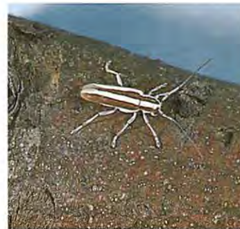
Fig. 1. Adult roundheaded appletree borer (actual size)

The adult roundheaded appletree borer is an attractive beetle about 5/8–1 inch (15–20 mm) long, olive brown with two longitudinal white stripes running the length of the body, and gray antennae, which are stout, many-segmented, and approximately body length. Its legs are also gray, the underside of the insect is silvery white, and its entire body is covered with fine hairs that give it a neat appearance (fig. 1). This species requires 2–3 years to complete its development, depending on location; most (perhaps two-thirds) occurring in New York probably require 3 years. Beetles emerge mostly at night through round, pencil-size holes from the bases of infested trees over a period of 2–3 weeks, usually during mid-June in New York, although they may appear in the trees as much as a month earlier. After emerging, the adults feed on the leaves, twigs, and fruit of host plants. Mating occurs about one week after emergence, and the fe-