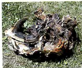
Fig. 12. Portion of an apple crown showing galleries made by Prionus borers