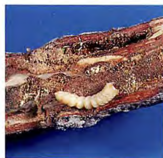
Fig. 5. Galleries of roundheaded appletree borer showing frass