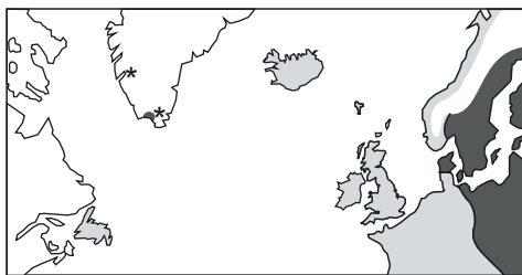
Figure 1 Distribution of M. m. musculus (dark shaded) and M. m. domesticus (lighter shaded) in northern Europe and the North Atlantic region from previously published data and data collected here (Iceland, Greenland, Newfoundland). Areas with no shading either have no house mice or the subspecies distribution is unknown, and areas with some admixture of the two are shaded according to the dominant subspecies. The locations marked with asterisks are sites in Greenland represented by ancient DNA samples. From the mtDNA haplotypes, these were M. m. domesticus derived from the Icelandic population.

For the ancient DNA samples, whole pulverised femurs were incubated in 1.5 ml 0.5 M EDTA pH 8 on a shaking platform for 12 h and the resulting solution spun through a Centricon tube until 200 \mu l of liquid remained. This concentrated liquid was then purified and cleaned using the Qiagen QIAQuick kit [21]. All