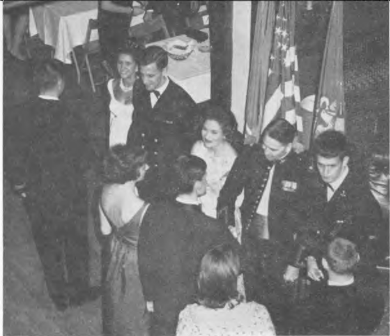
Receiving line at the Navy Ball.