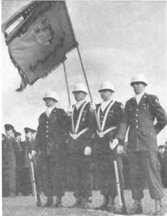
Army cadet color guard prepares to pass in review.