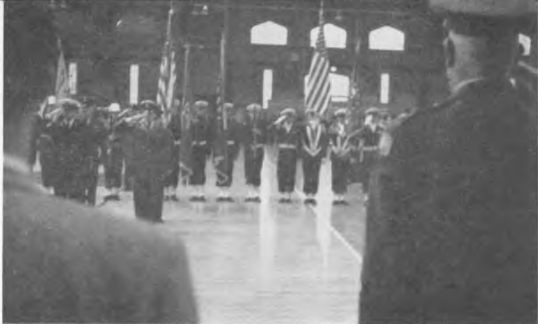
Color guards of the Army, Navy, and Air Force at the annual Presidential Review conducted by the tri-service ROTC Brigade.