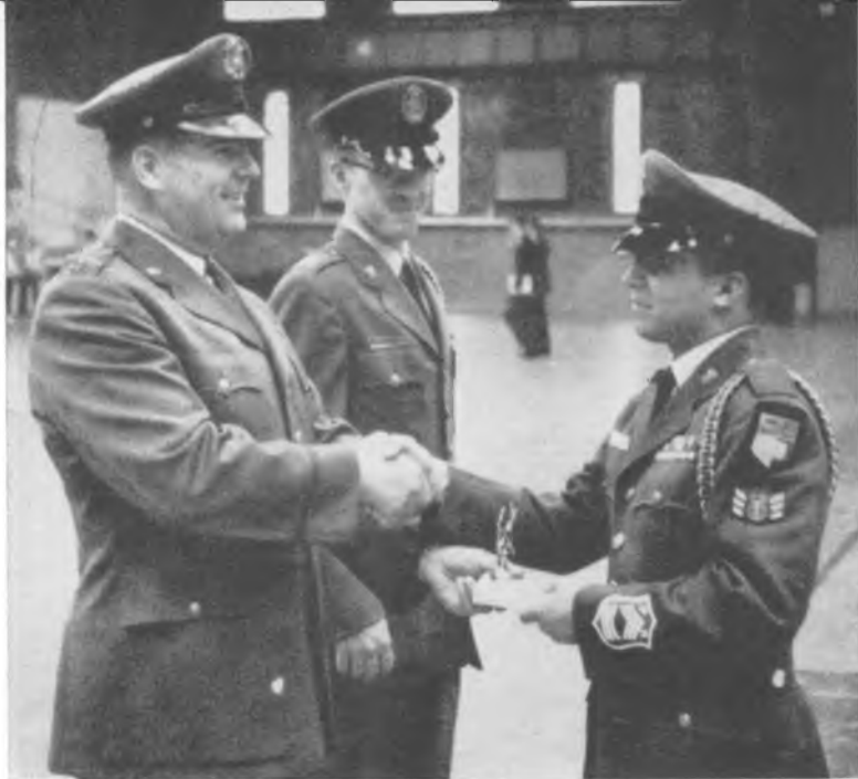
Presentation of the Burns Memorial Trophy.