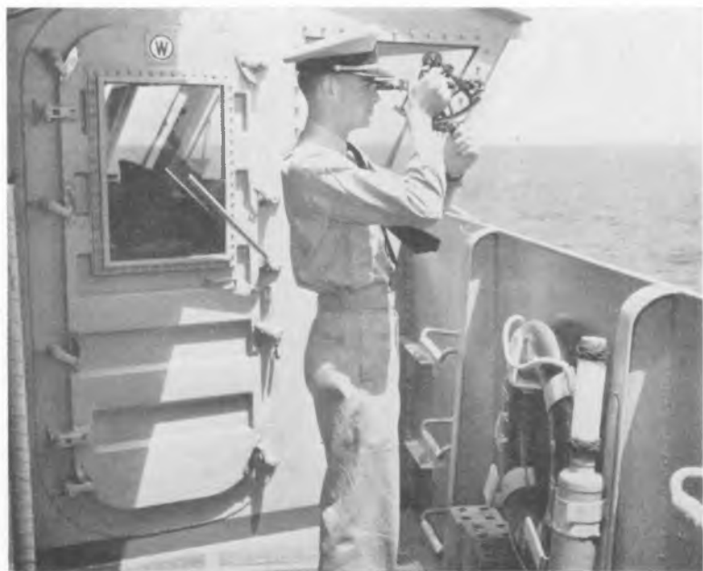
Summer cruise. Midshipman shooting the sun.