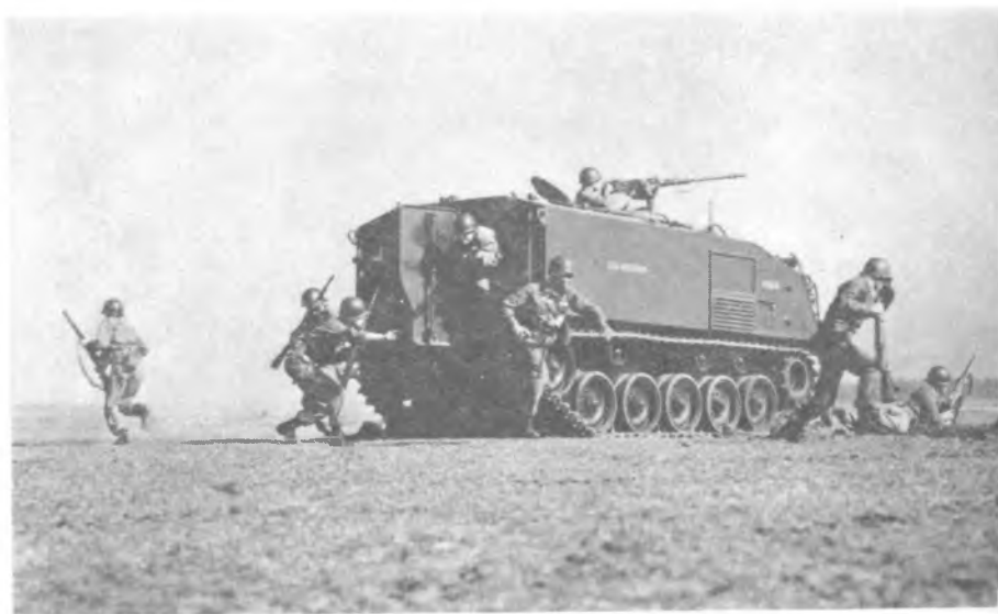
In summer camp Army ROTC cadets participate in demonstrations that utilize the newest Army equipment.