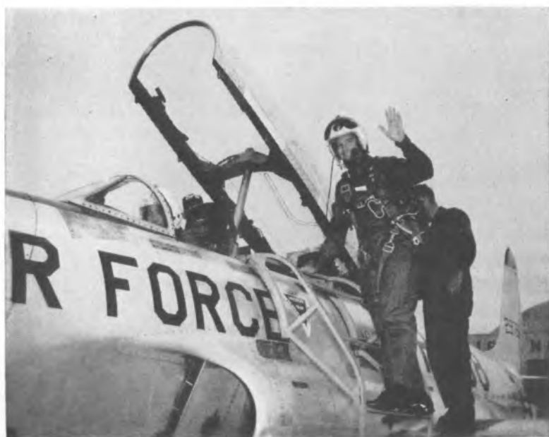
Advance cadet begins jet orientation during summer training.