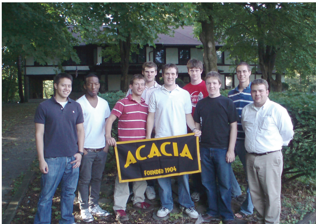
Brothers of the Cornell and Syracuse chapters and Toronto colony