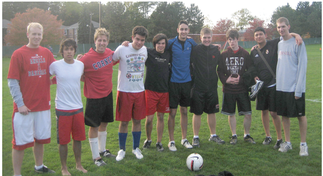
The Acacia soccer team poses after its final match of the fall 2009 season.