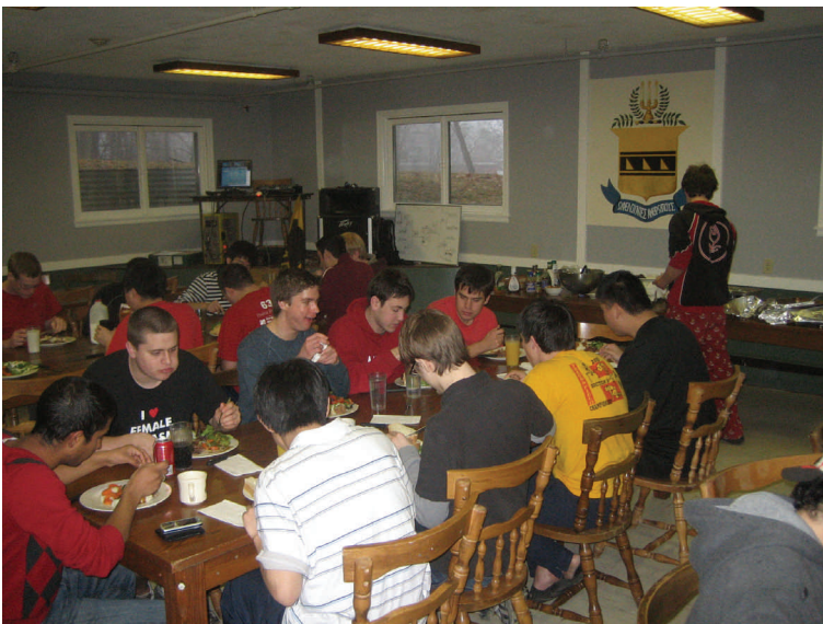
Brothers enjoying a hot meal as winter closed in faster than usual this year.