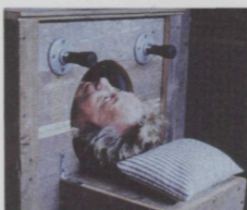
Figure 3 CASE STUDY 5510

Two people participate. They select one of two viewing positions: face down viewing a 19-inch monitor that plays a video tape of the inside of an empty basket, or face up viewing a chopping block (see Figures 3 and 4).