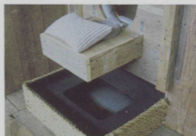
Figure 4 CASE STUDY 5510

The guillotines operate by inserting a quarter, activating a 3.5 minute performance. The performance begins with a video image displayed on a 13-inch monitor depicting a 3/4" rope unwinding (virtually appearing to unwind). The monitor is positioned between the two guillotines, a frontal view designed for the audience. A 3-D metal wheel spins with the synchronization of the video image of the rope in motion. The spinning wheel enhances the realism and builds a degree of anticipation (see Figure 5).