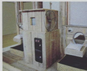
Figure 2 CASE STUDY 5510

Two people participate. They select one of two viewing positions: face down viewing a 19-inch monitor that plays a video tape of the inside of an empty basket, or face up viewing a chopping block (see Figures 3 and 4).