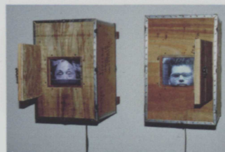
Figure 6 CASE STUDY 5510

CASE STUDY 5510-B is an extension of CASE STUDY 5510. With two surveillance cameras mounted on the top of each guillotine, CASE STUDY 5510-B captures a unique visual language (perhaps, a pure language): the facial gestures of the two subjects as they experience the simulation of a beheading machine. Their expressions are depicted on two 13-inch monitors mounted on a wall in a remote location of the gallery. The monitors show a live video image (a close-up view) of each subject, capturing their facial expressions as the spikes fall (see Figures 6 and 7).