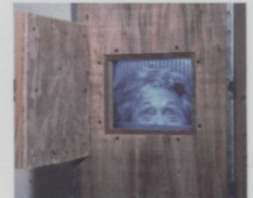
Figure 7 CASE STUDY 5510

CASE STUDY 5510 & 5510-B applies elements of danger and anticipation of a near death experience as initial stimulants to encourage audience participation. CASE STUDY 5510 & 5510-B are 3-D models that exemplify scientific theories in the field of psychophysiology. The work additionally offers multiple perspectives and dialogues: the historical context of guillotines and the promotion of a social gathering; the issue of control insofar as technology becomes the executor, replacing the human administrator; the monetary value of 25 cents reflecting the worth of a human life, including the topic of entertainment at the expense of another's vulnerability. For the purpose of this paper, the focus is on the facial expressions of the participants (subjects). CASE STUDY 5510-B records these