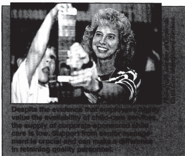
Despite the evidence that employees value the availability of child-care benefits, the supply of corporate-sponsored child care is low. Support from senior management is crucial and can make a difference in retaining quality personnel.

Introducing a child-care-benefit program may seem like a radical step. However, in the face of compelling demographical statistics and competition from employers that do offer such programs, you may have little choice. Where