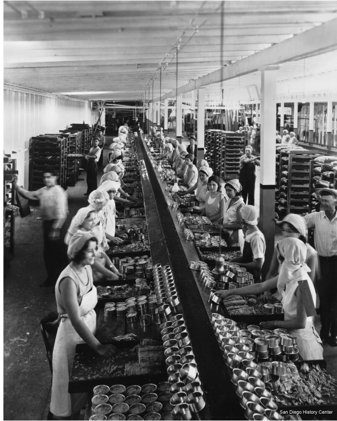
Figure 4.1. Women canning tuna at Cohn-Hopkins Company, 1931.

of a worker's progress. Each time a tray was completed, the overseer punched a hole through a tray count sheet pinned to a worker's back. On the piece rate system, more holes meant bigger paychecks, thus cannery women found it imperative to work with speed and precision. 67