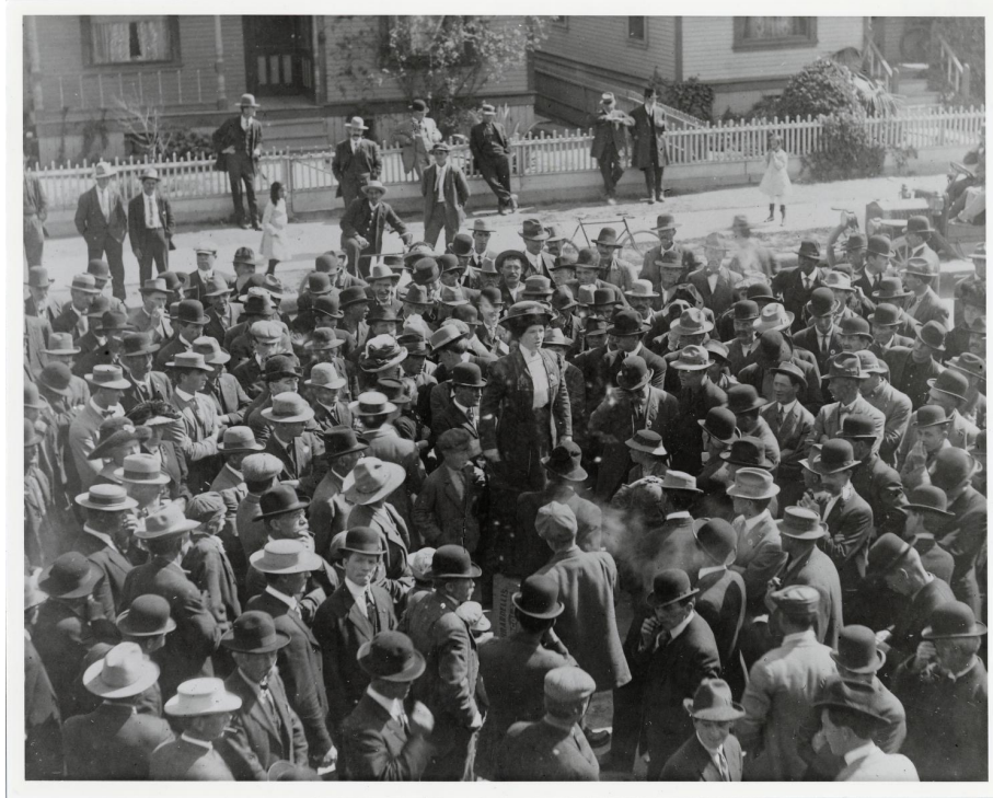
Figure 2.1. Woman standing on soapbox in IWW demonstration, San Diego, 1912.

Less than 48 hours after the police suppression of soapboxing in the restricted zone, the Union published Clark Braly's op-ed on how to halt further demonstrations. Braly, an influential booster who was once supervisor for the massive Spanish-themed city park under construction, suggested a "horsewhip vigilance committee to deal with the hordes" of Wobblies now in San Diego. The daily quoted Braly: