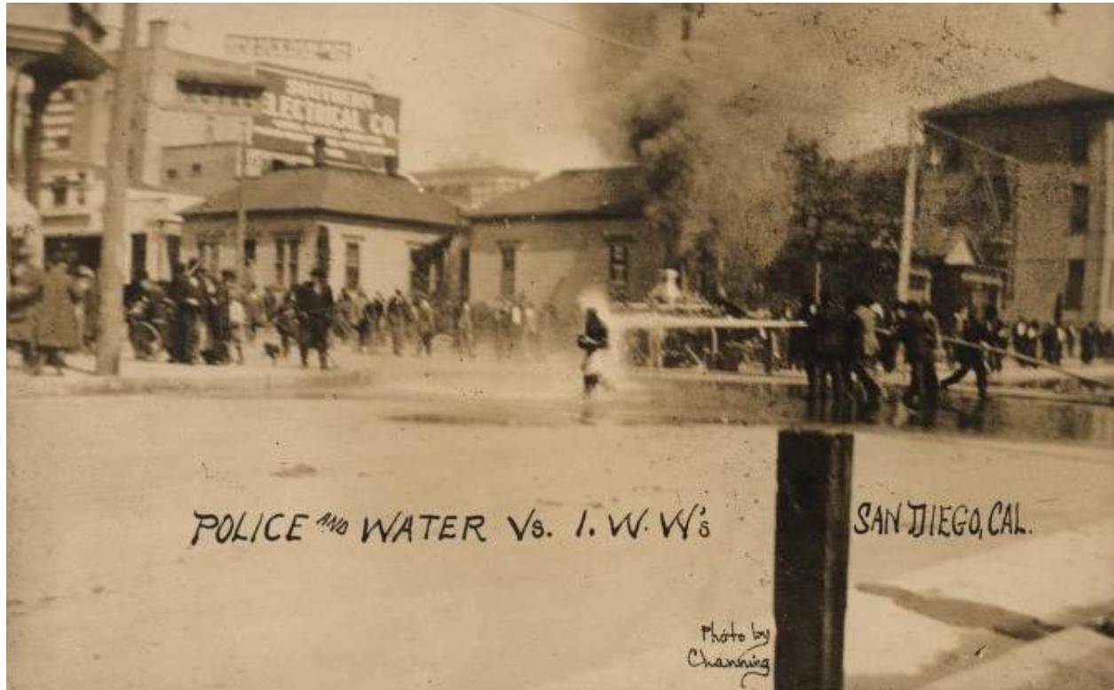
Figure 2.2. Police and water vs. IWWs, San Diego.