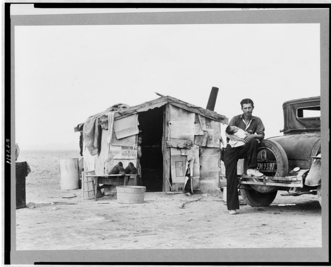
Figure 3.2. Migratory Mexican field worker's home on the edge of a frozen pea field – Imperial Valley, March 1937, photograph by Dorothea Lange. Courtesy of the Library of Congress, Farm Security Administration – Office of War Information Photograph Collection, Library of Congress Prints and Photographs Division, Washington D.C.

since union membership drew not only from workers, but also labor contractors and merchants. 124