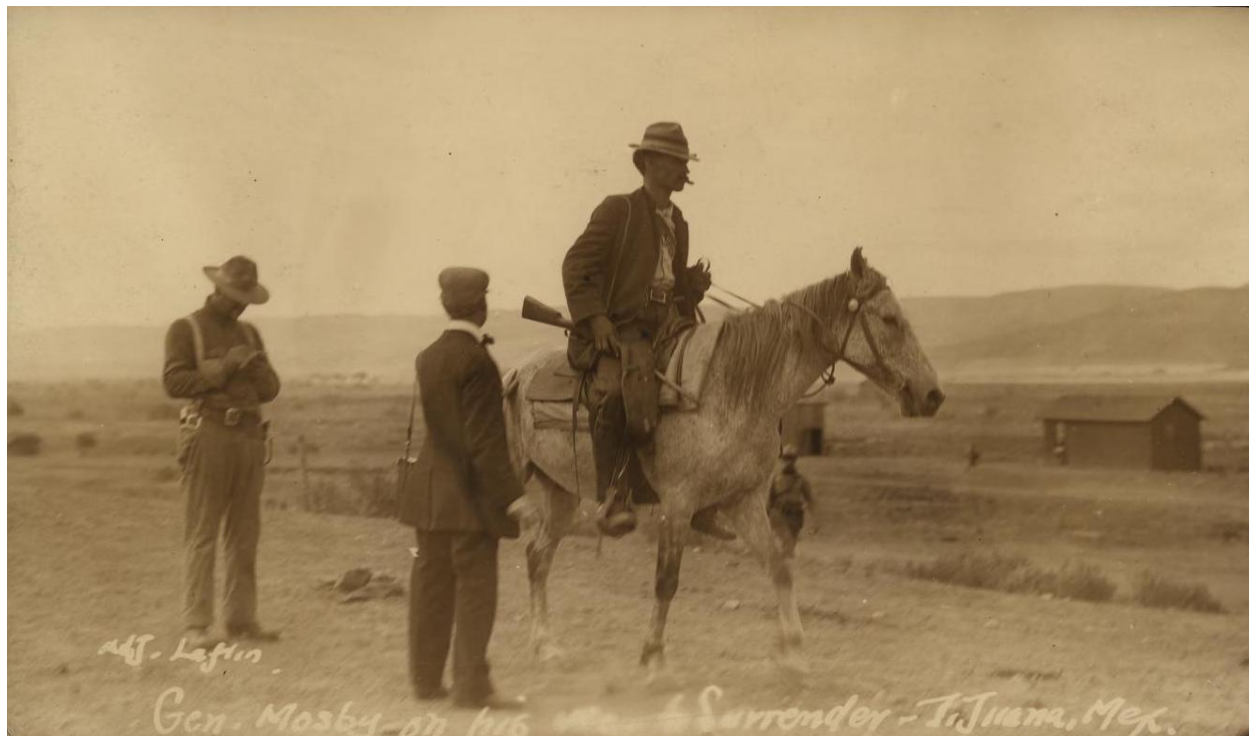
Figure 1.2. General Mosby on his way to surrender.

Mexican federal troops by entering the United States, only to be greeted by American federal troops who quickly detained them. Insurgents were put in a “containment camp” within the prison camp at nearby Fort Rosecrans, which the San Diego Union celebrated since it meant that the San Diego & Arizona Railway could be completed without more disturbances. 149