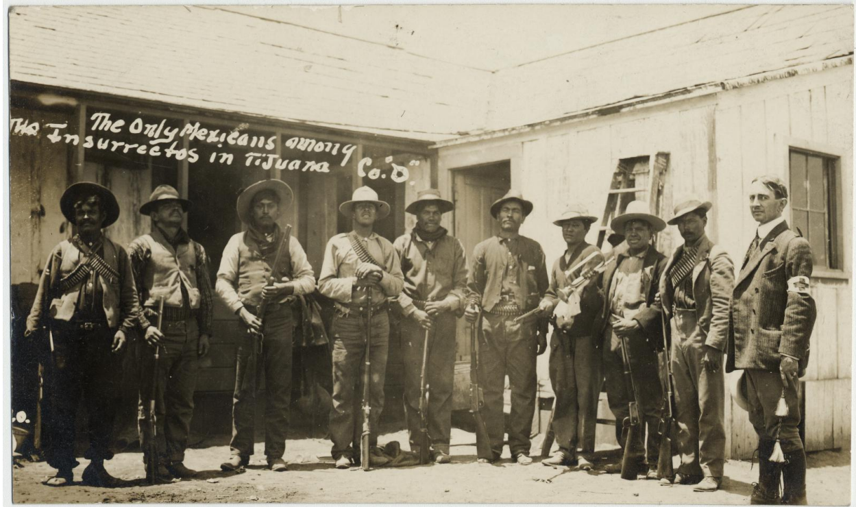
Figure 1.1. Mexican Revolution.