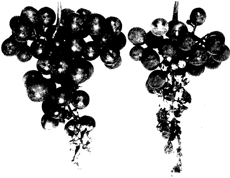
FIG. 3.—BUNCHES OF GRAPES SHOWING THE EFFECT OF ROT BY DOWNY MILDEW.

summer. These diseased leaves and bunches fall to the ground where the fungus remains until next June. By this time, the perithecia have become mature and will produce ascospores under suitable weather conditions. The ascospores will produce the primary infection on the leaves and young bunches. After about 10 days, conidia are produced in the diseased spots and spread the disease to the healthy leaves and bunches. This secondary infection continues thruout the summer whenever weather conditions are suitable. Powdery mildew infection appears as a superficial, whitish growth on the upper surface of the leaves, berries, stems, and pedicels of the bunches, while the black rot and downy mildew both produce definite dead areas in the leaves and a rot of the berries. Sprays applied to give protection from the primary and secondary infection periods should control the powdery mildew.