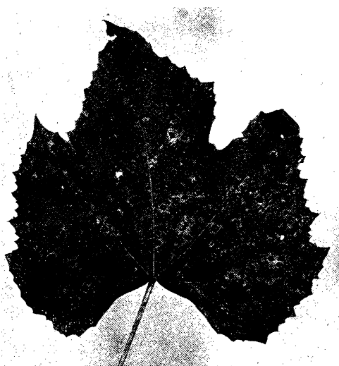
FIG. 1.—TYPICAL BLACK ROT LESIONS ON A CONCORD GRAPE LEAF.

Downy mildew, Plasmopara viticola , may cause a rot of the bunches or defoliation of the vines (Figs. 3 and 6). Thus, the downy mildew can injure the vines by premature defoliation, as well as causing a rot of the bunches of grapes. This fungus spends the winter in the dead, diseased leaves and bunches in which the oospores were produced during the summer. The oospores are set free by the rotting of the leaf tissue in the spring. Under suitable moisture conditions, the oospores germinate and form swarmspores which are splashed by the rain onto the young leaves. This usually occurs during the month