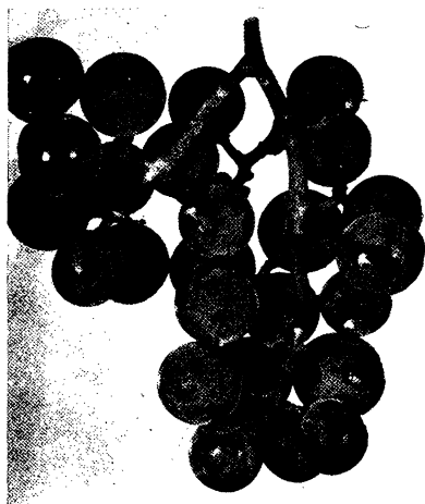
FIG. 5.—A BUNCH OF CONCORD GRAPES SHOWING POWDERY MILDEW ON THE STEMS.

been obtained. Notes were made as to whether the disease was present on the leaves or bunches, or on both, and the severity of the disease. The amount of disease recorded was the maximum observed at any time during the period of 1940 to 1944, inclusive, and shows the relative susceptibility of the variety. It does not mean that the recorded severity of the disease was present in all vineyards thruout the State.