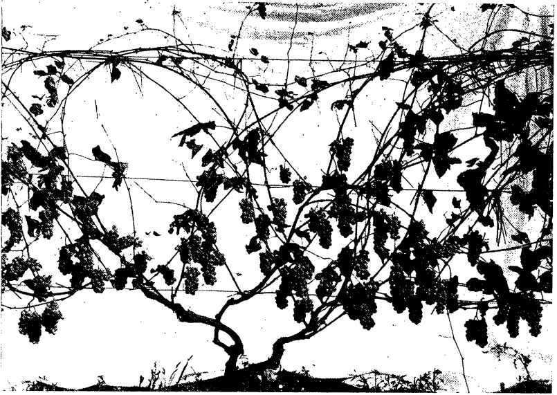
FIG. 6.—DELAWARE VINE DEFOLIATED BY DOWNY MILDEW. Photographed on September 9, 1942.

plots which were prematurely defoliated in September, 1942, an average of only 5.4 viable primary buds occurred. These results indicate that a severe attack of downy mildew not only defoliates the vines but also weakens the buds so that they are more susceptible to winter injury.