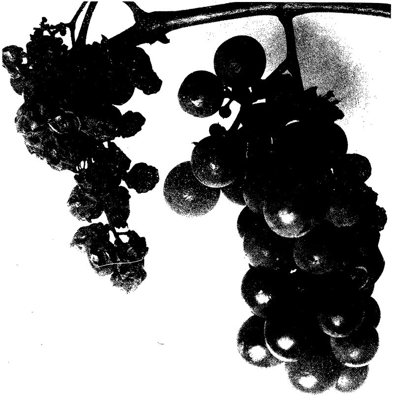
FIG. 2.—BUNCHES OF CONCORD GRAPES SHOWING BLACK ROT.

of June and constitutes the primary infection. After about 10 days, the spots, which are at first yellowish in color later becoming brown, will show the presence of white masses of conidia produced by the fungus on the under side of the leaf. These conidia spread the disease to other leaves and bunches thruout the summer whenever weather conditions are favorable. Thus, the secondary infection has occurred and the cycle is completed. The proper application of sprays to control the primary and secondary infection is necessary for satisfactory results, while eradicant fungicides applied to the soil might give some control of the overwintered phase of the fungus.