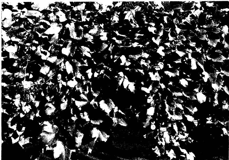
FIG. 7.—DELAWARE VINE SPRAYED WITH THREE APPLICATIONS OF BORDEAUX MIXTURE, 3-3-100, PLUS 1 POUND OF ROSIN FISH OIL SOAP.

This vine was in a sprayed row which was adjacent to the vine shown in Fig. 6. Photographed on September 9, 1942.