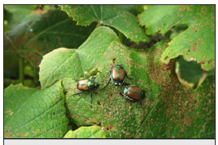
Japanese beetles feeding on Concord leaves.

feeding will depend on a number of factors including health and size of the vine and the cultivar. Moreover, if it is a high value cultivar then the economic injury level will be lower compared to a lower value cultivar. Young vines in growth tubes may be particularly vulnerable in that they have fewer reserves to draw upon to recover from damage and the beetles are protected in the tubes from insecticide sprays. You should make a special effort to regularly monitor vines inside growth tubes for Japanese beetles and apply insecticides directly into the tubes if treatment is warranted. Grape cultivars do seem to vary in resistance to Japanese beetle. Thick leaved native cultivars are the most resistant followed by hybrids and then V. vinifera .