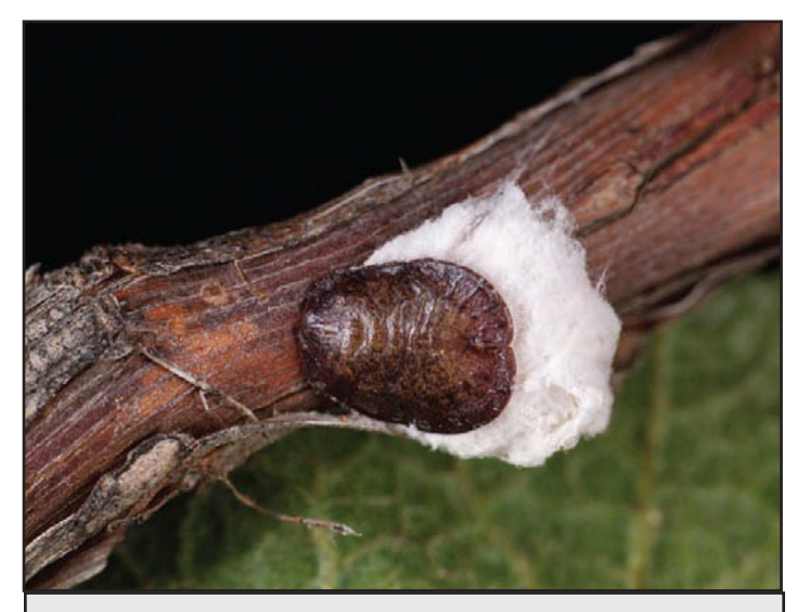
Soft scale female with white egg sac.

Soft scales and Mealybugs. Soft scales and mealybugs are sucking insects that spend part of their life-cycle on the canes or the trunk and part out on leaves or fruit. At high densities they can reduce vine vigor or contaminate grape clusters with their sugary excrement, which supports the development of sooty mold. However, the major concern