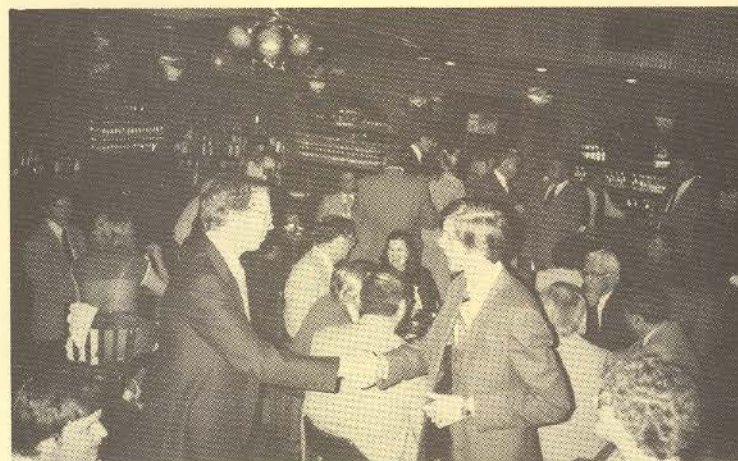
THE YEARS REUNITED