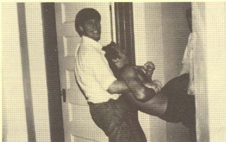
OFF TO THE SHOWERS!