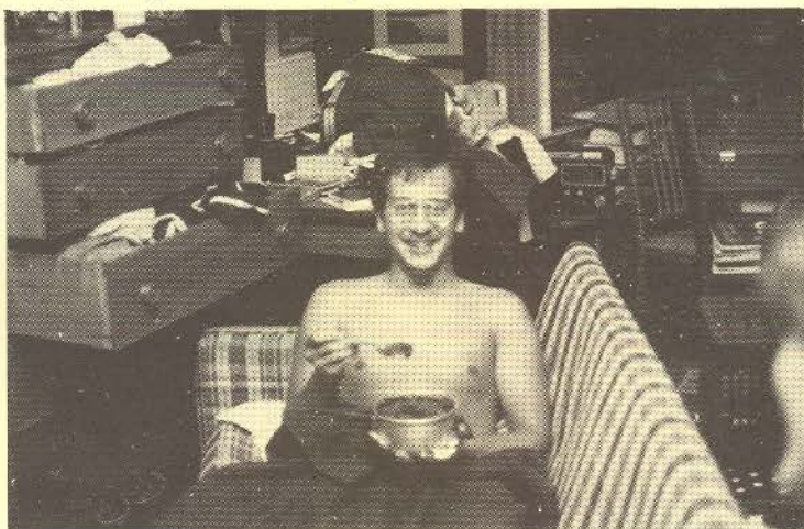
JUST LIKE MOM MAKES

EDITOR'S NOTE: As it now stands, Alumni Dues and Donations for Cornell Acacia are not tax deductible. Houses that are owned by the University can have these deducted, but since we own our house, we cannot. This is very unfair, and as a result University owned fraternities receive greater alumni financial support. This is common to all fraternities at colleges nationwide and many national's have been trying to lobby in Washington and have this changed for years. We are currently looking for some legal advice on a new approach for ourselves. We are considering setting up an Educational Fund (which would be deductible) to replace current Alumni Dues. Money would still be used as it is now, but it would hopefully increase the amount we receive. If you or any other readers have any comments or ideas concerning this problem, please feel free to get back to me.