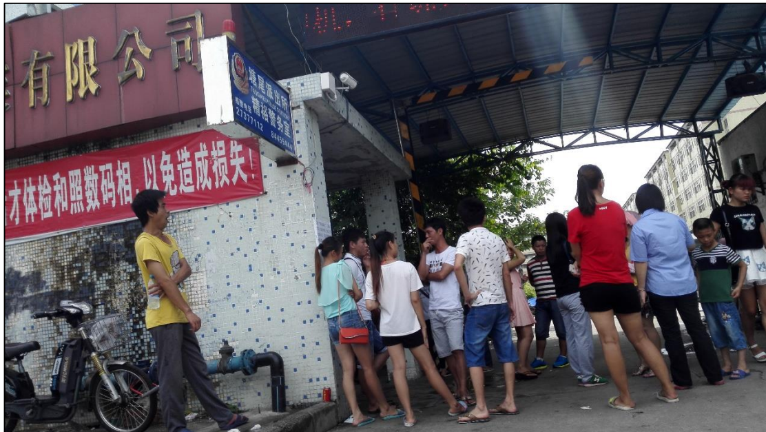
People applying for a job at Jingyu

On July 17, CLW carried out a follow-up investigation to understand more about the strike and Jingyu's labor conditions. There was no sign of any protest activity during that day. People were applying for jobs at the plant, though the factory was only hiring women. CLW's investigator interviewed a number of current Jingyu workers, collecting the following findings.