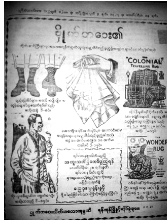
Figure 6: Colonial Rug, Shoes, etc.