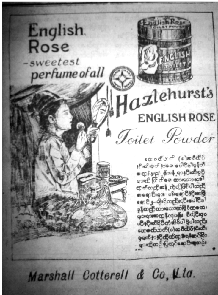
Figure 5: Hazlehurst's English Rose Toilet Powder