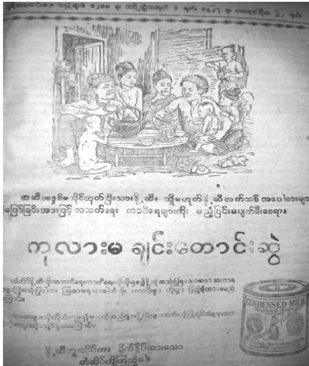
Figure 4: Milkmaid Brand Anglo-Swiss condensed milk