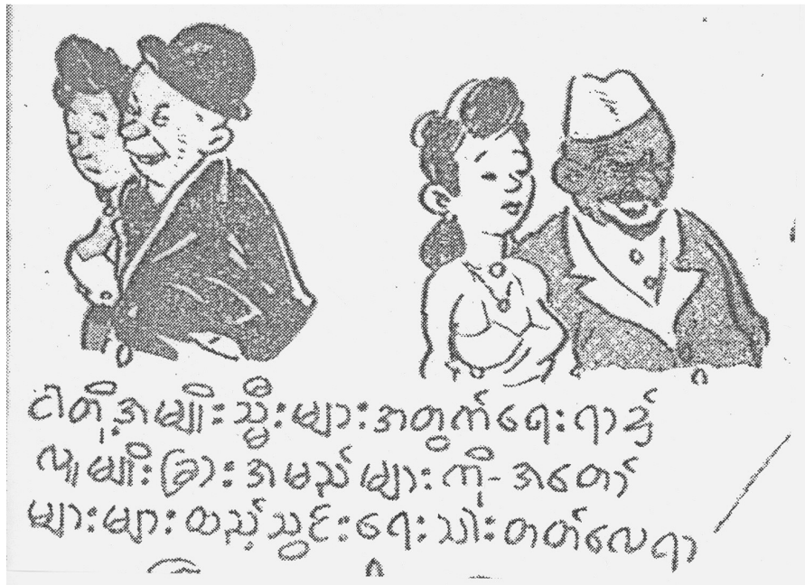
Figure 2: Burmese-Chinese & Burmese Indian Couples