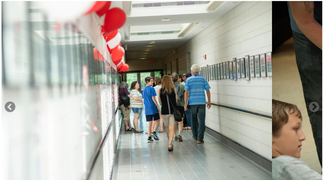
Scenes from CVM Reunion 2019