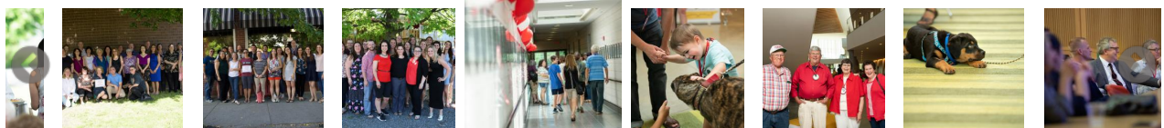
Scenes from CVM R