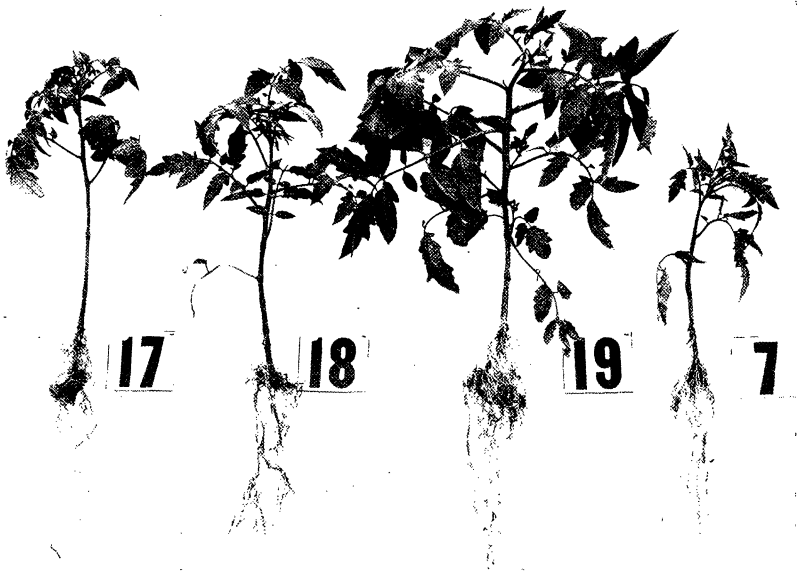
FIG. 2.—SHOWING IMPORTANCE OF BALANCED NUTRIENTS IN STARTER SOLUTIONS FOR TOMATOES.

Altho nitrate of soda alone (No. 17, Table 1) and superphosphate alone (No. 18) made very poor starter solutions, when the two ingredients were added together (No. 19) the balanced solution produced excellent plants, notwithstanding the extreme acidity of this solution due to the superphosphate. On the acid soil this solution caused some root injury at first, but the plants quickly recovered and made a strong growth as shown in No. 19, Fig. 2.