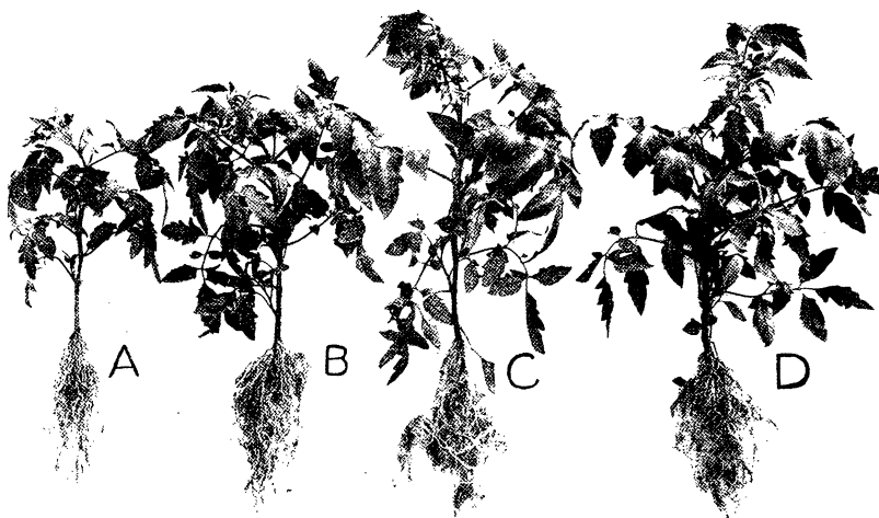
FIG. 3.—EFFECT OF SOIL TYPE AND AGE OF TOMATO PLANTS AT TRANSPLANTING TIME ON RAPIDITY OF GROWTH.

crop, that is with 108 seedlings to the flat. Under such crowded conditions the plants become hardened and partially starved and they do not pick up quite so quickly as younger plants that have not been so severely checked in growth. A similar result is well illustrated in Fig. 3 which shows typical plants of the two ages used in the greenhouse experiment reported here. In 23 days after transplanting, the plants