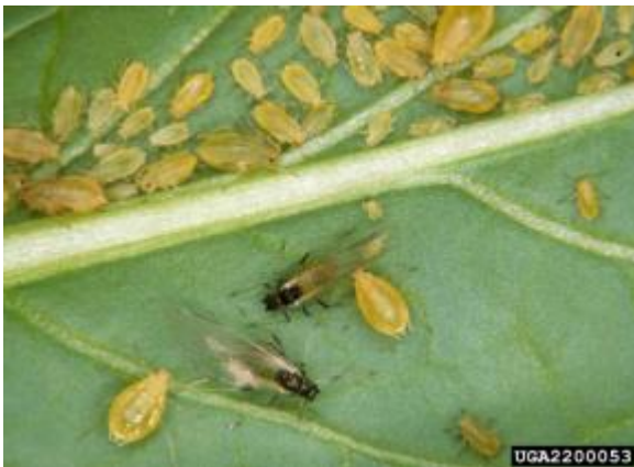
Green Peach Aphid: nymphs, winged adults, and wingless adults.