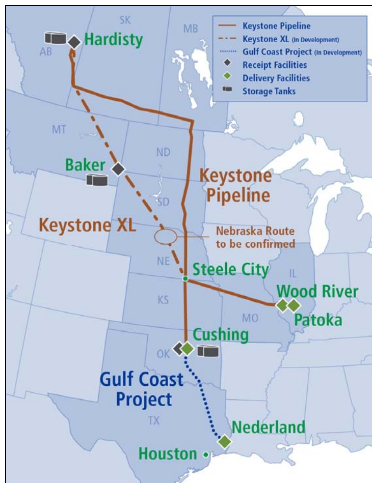
Figure 1. The TransCanada Keystone Pipeline System: Keystone and Keystone XL