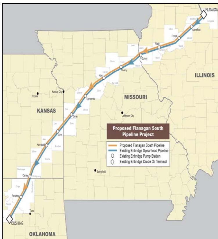
Figure 4. Proposed Enbridge Flanagan South Pipeline Route