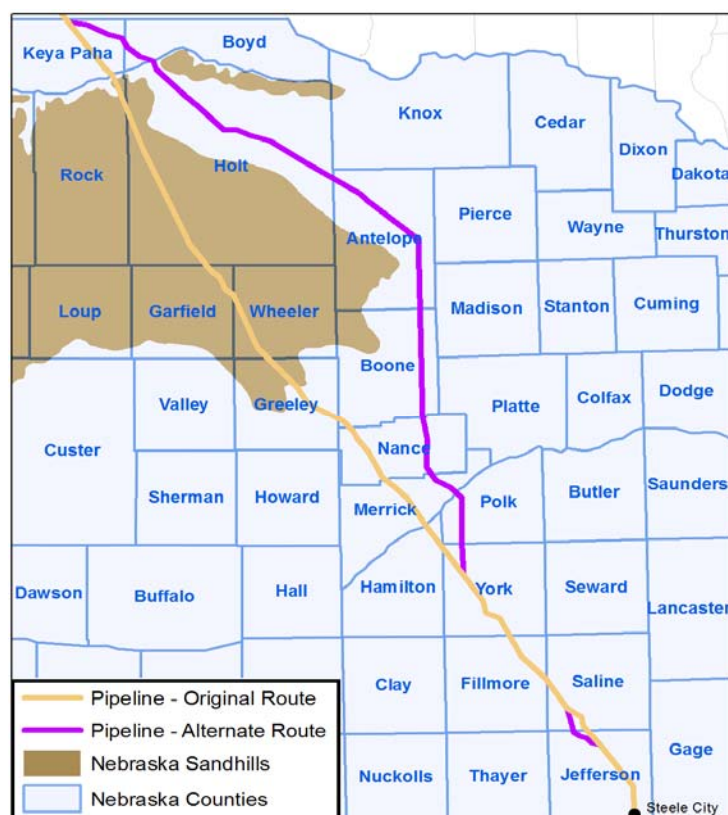
Figure 2. Keystone XL Preferred Alternative Route in Nebraska

Sources: Congressional Research Service, adapted from TransCanada, TransCanada Keystone XL Pipeline Project, SER for the Nebraska Reroute , September 5, 2012, p. 4, https://ecmp.nebraska.gov/deq-seis/DisplayDoc.aspx?DocID=1FDGc%2bzrMX00I4O41xNwaA%3d%3d ; Sandhills shape file from University of Nebraska, http://snr.unl.edu/data/geographygis/NebrGISgeology.asp#topography .