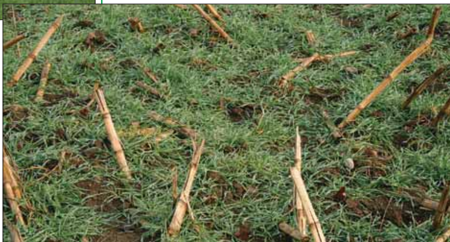
Winter triticale, fall 2010, van Slyke Farm, Wyoming Co NY

"It is a balance. It may not work on other farms," he said. "It's only our first year but everything points positive. Timing, like any grass, is going to be critical. If it worked so well in the weather of 2011, it will probably work in any season."