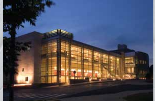
The Robert A. and Jan M. Beck Center at Cornell University