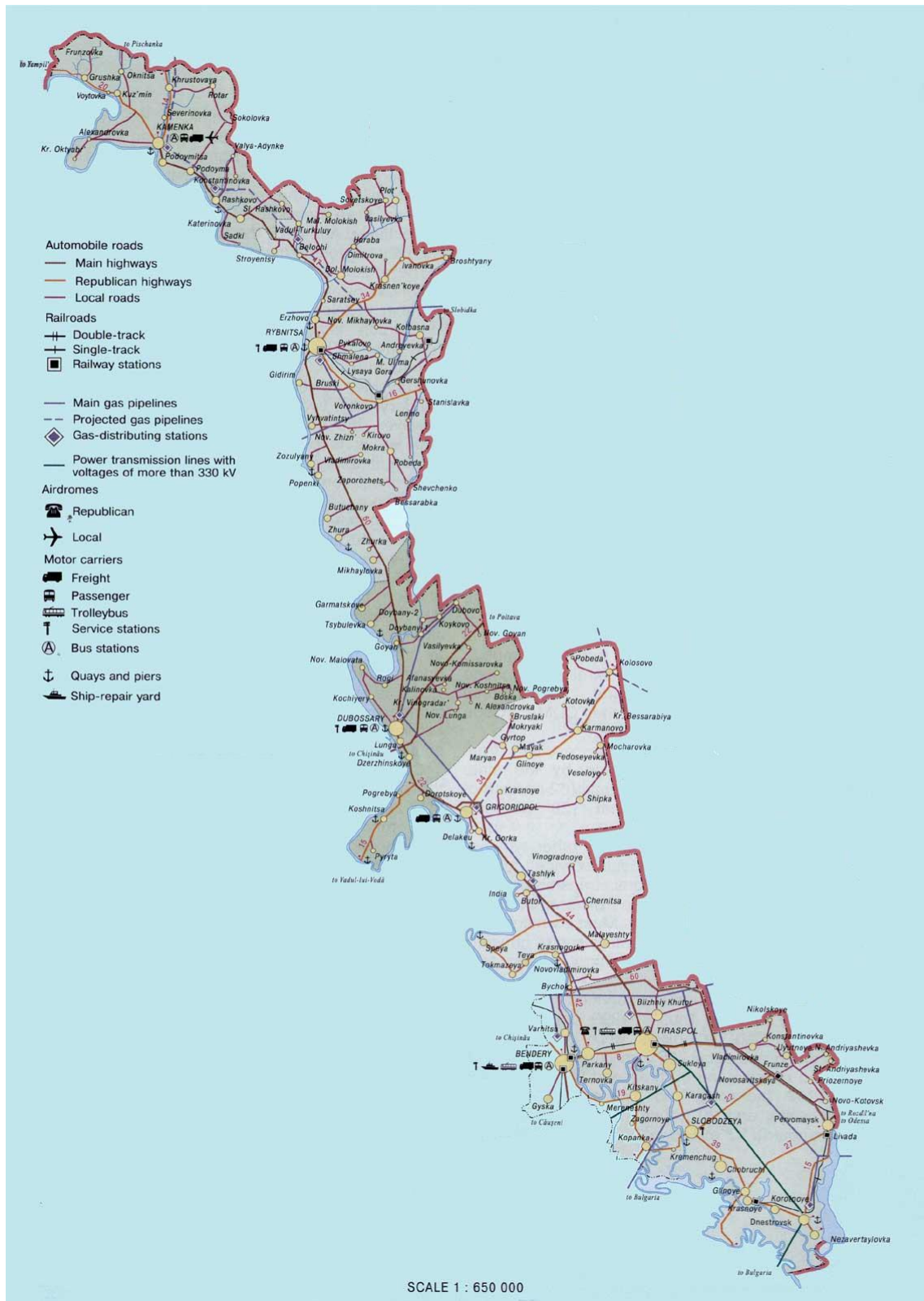
Figure 4. Transportation routes in Transnistria.