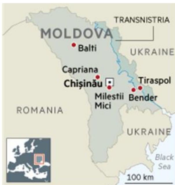
Figure 3. Moldova and Transnistria