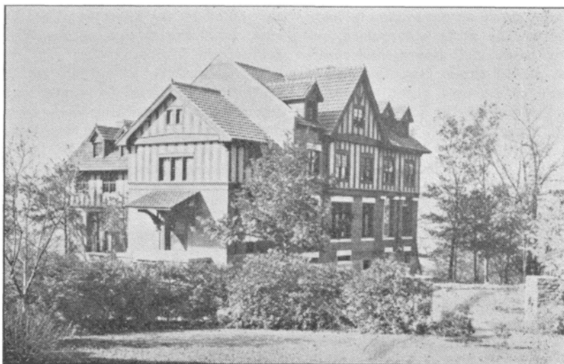
THE SIGMA NU HOUSE.