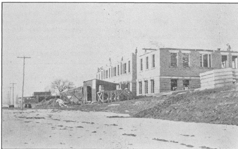
THE NEW POULTRY BUILDING.