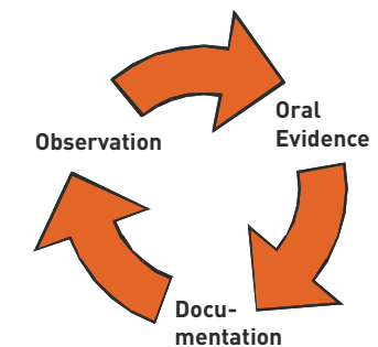
Figure 1 Circle of Evidence