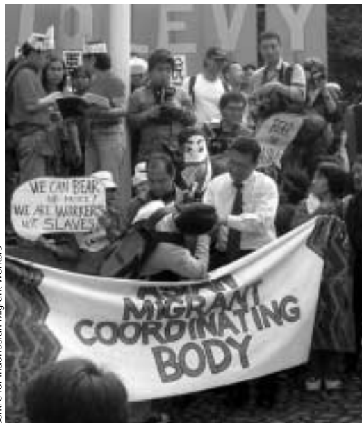
Centre for Indonesian Migrant Workers

On 23 February 2003, 12,000 people protested against the Hong Kong Government's proposal of a tax on migrant workers