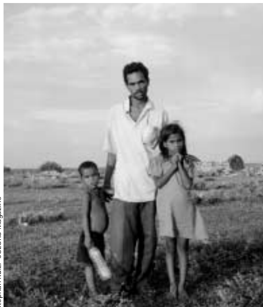
Stephan Ruiz / COLORES Magazine

These sections include the definition of a migrant worker as "a person who is to be engaged, is engaged or has been engaged in a remunerated activity in a State of which he or she is not a national" (Art. 2). Family members are defined (Art. 4) and a non-discrimination article is included (Art. 7).