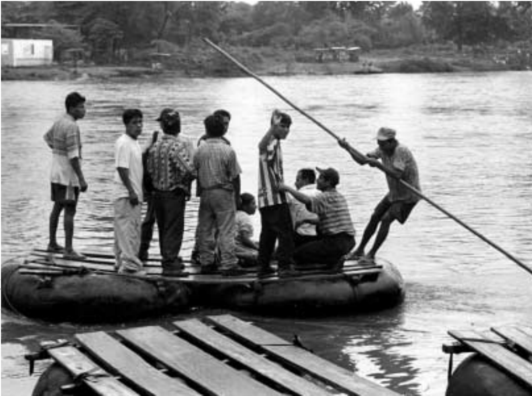
Irregular migrants cross the Rio Grande to the United States by raft.

© IOM 2002 - MMX0002 photographer DeCesare