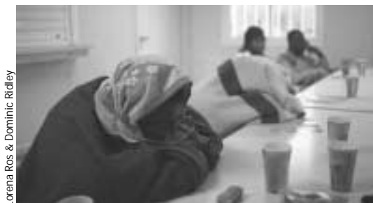
Newly arrived migrants in a detention centre, Spain.

However, the prevention components of anti-trafficking programmes frequently focus on seeking to discourage migrants from travelling abroad in search of work by highlighting the dangers to them. Such campaigns are unlikely to have much impact when there is a growing demand for migrant workers in developed countries and a strong supply of migrant workers, many of whom are willing to take substantial risks in order to obtain work which they see as a means of survival for themselves or their families. If governments wish to prevent trafficking, then they need to review current international migration trends and amend existing policies which have played a significant part in increasing the demand for traffickers and smugglers.