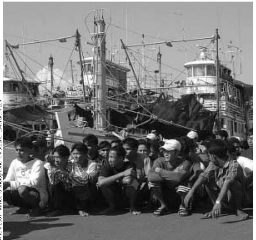
A group of seventy-six trafficked Cambodian fishermen stranded aboard Thai fishing vessels, impounded by the Indonesian navy, wait at Surabaya naval base, to be returned home.

Clearly, remittances are already an extremely important source of foreign income for many national economies. However, within the context of the increased demand for migrant workers, it is important to try and ensure that more remittances go back to the country and people that need them and that their potential to promote sustained development is fully harnessed. Addressing the following issues will help to facilitate this: