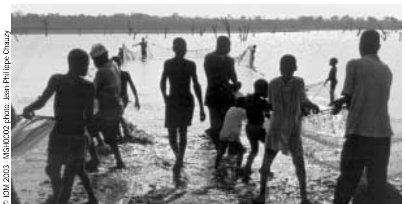
© IOM 2003 - MGH0002 photo: Jean-Philippe Chauzy

Despite these difficulties, the collection of detailed information about trafficking, which includes reliable base line statistics and a detailed analysis of individual cases, is essential if we are to understand the traffickers' modus operandi , why people are being trafficked and how traffickers are maintaining control over them. These aspects can vary between different trafficking groups as well as from one country to another ( see 2.1 ). Only once this type of information has been collected will it be possible to put together an effective counter trafficking strategy which takes into account the individual circumstances in sending and receiving countries. Integrated counter trafficking policies should contain components which seek to ensure prosecutions of traffickers; the protection and support of trafficked people; and the prevention of trafficking through the implementation of measures to tackle the root causes of the problem.