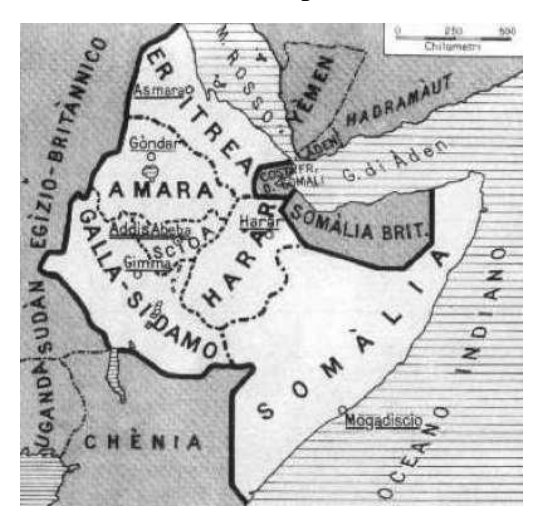
Italian residents in the AOI in 1939