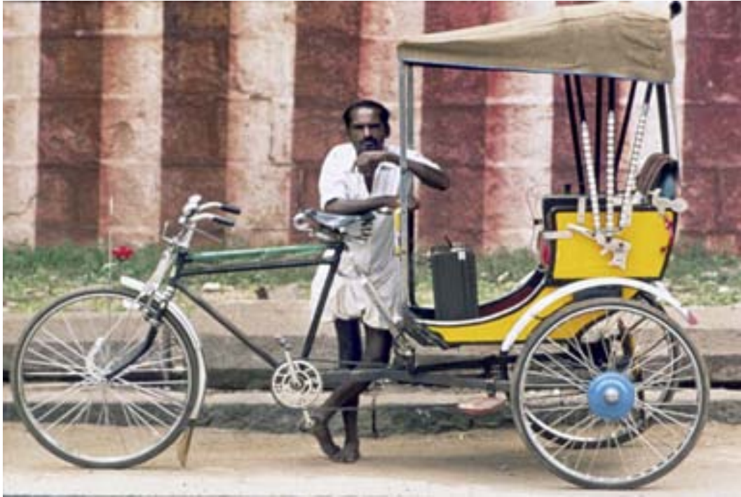
Figure 45. Rickshaw driver in front of exterior wall around precincts of Meenakshi Temple, Madurai, Tamil Nadu, India.